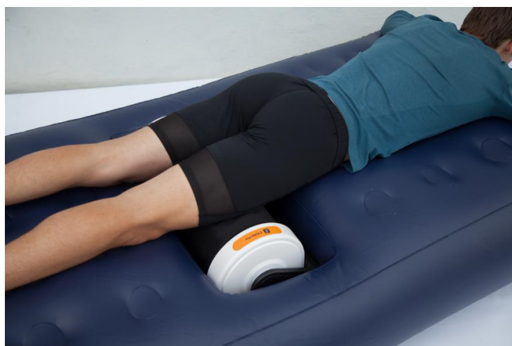
Figure 4. Participant laid face down on the mattress with the quadriceps muscle group placed on the Z-Roller.