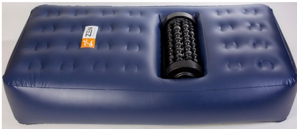
Figure 3. The Z-mattress placed over the Z-Roller.