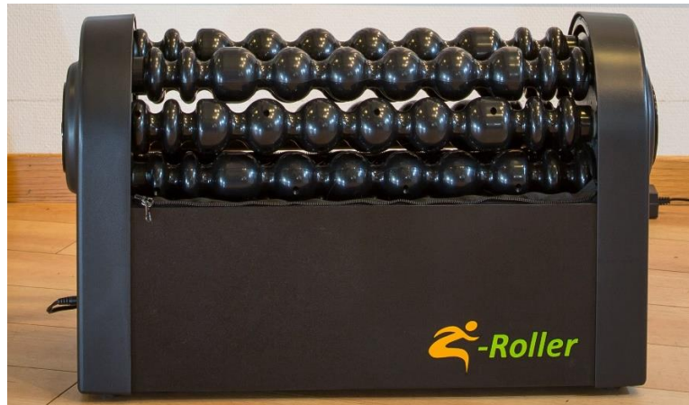
Figure 2. Z-Roller mechanical self-induced multi-bar roller-massager.

the Z-Roller (Figure 4). Furthermore, to measure the effect of post-performance myofascial tissue release (between competition recovery), participants started with a 15 min [3,38,39] quadriceps myofascial tissue release using the Z-Roller after the test to exhaustion was completed. All measures were identical to the measures collected on the control test day, including time intervals (Figure 1).