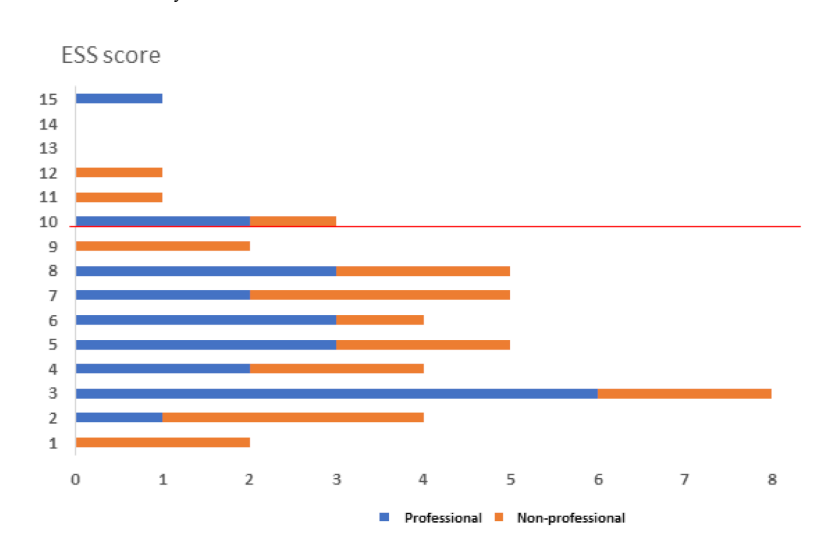
Figure 1. ESS scores are reported for professionals (blue bars) and non-professional athletes (orange bars). Scores >10 indicate a tendency to excessive sleepiness.