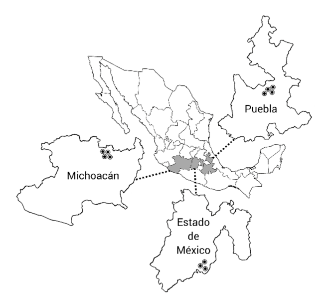
Figure 1. Region of Mexico were crops and sampling sites were developed.