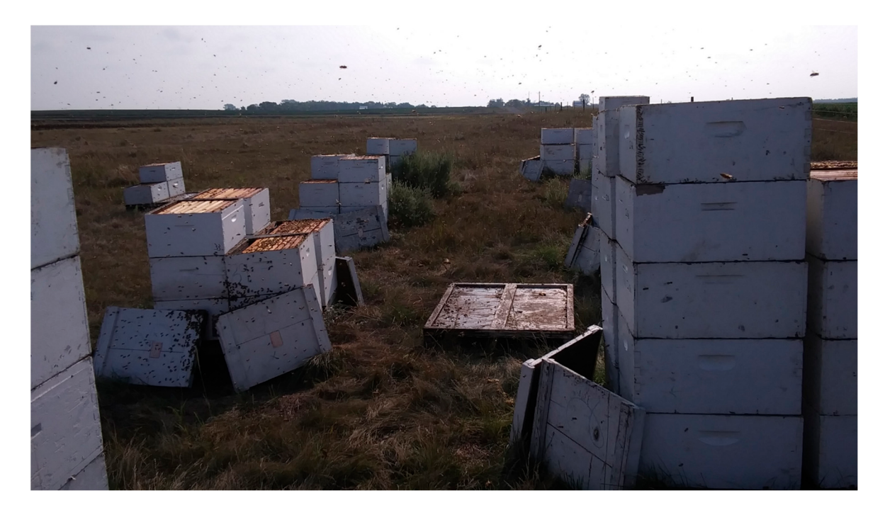
Figure 1. Honey extraction from sample colonies during the study, South Dakota. Yields were quantified to determine differences based on stock, location, and year.

2.3. Using Honey Bee Foraging Choice to Understand Colony-Level Dietary Deficiencies