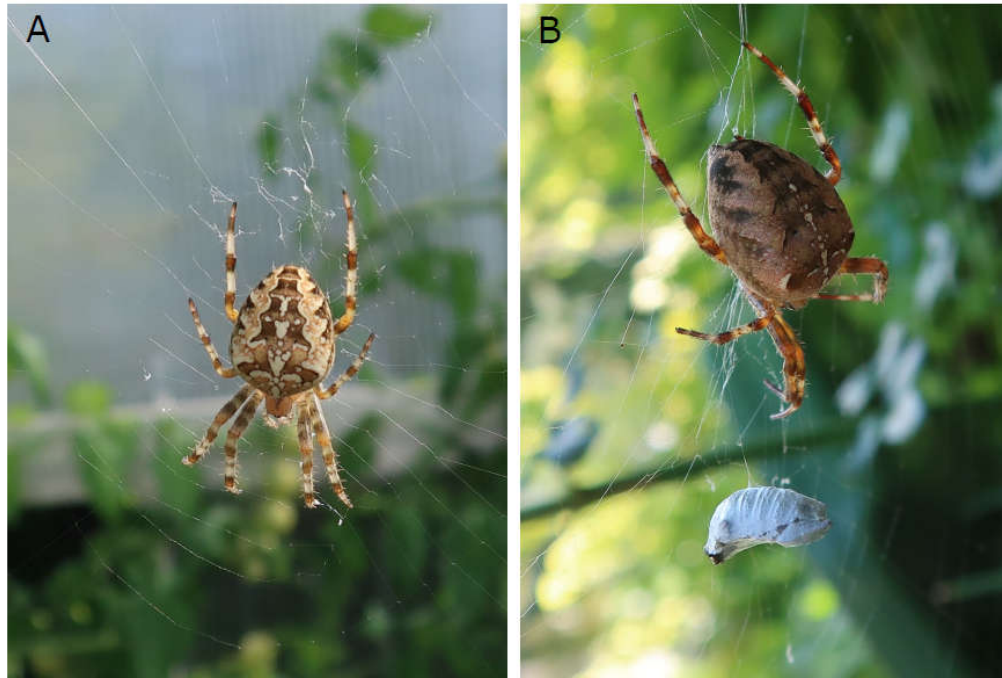
Figure 2. A–B. Adult female Araneus diadematus in web in a garden in Flawil, northeastern Switzerland.