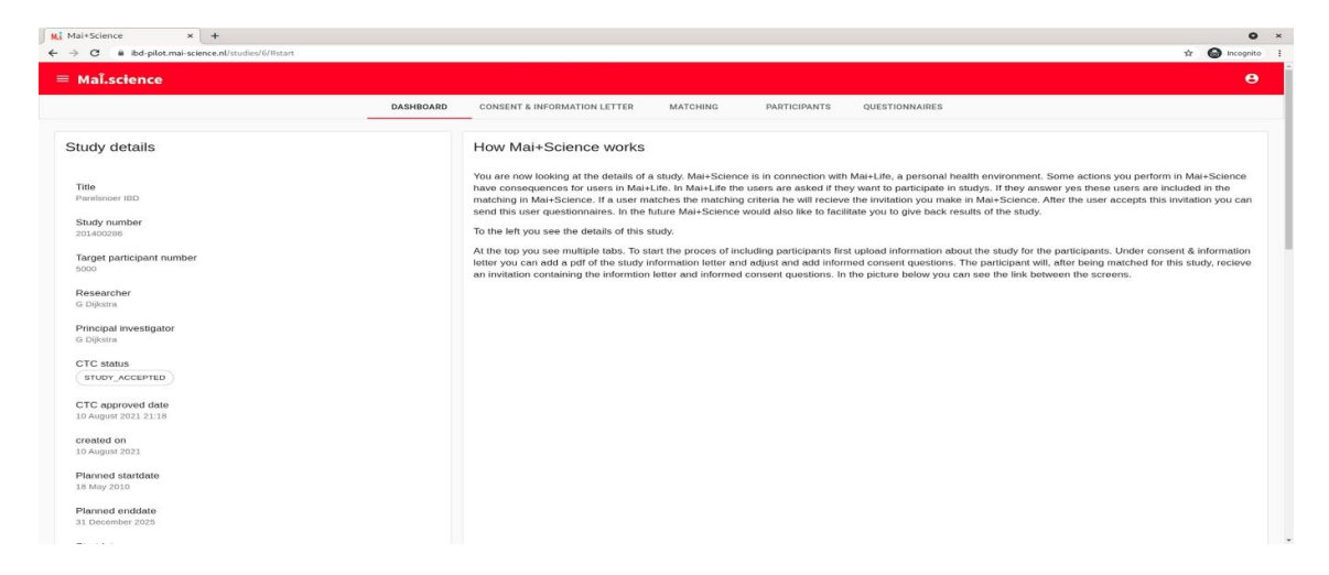
Figure 3. Screenshot of Mai+Science dashboard.

First, only the scientific researchers from the University Medical Center Groningen (UMCG) had access to Mai+Science despite its aim to provide multiple centers with access to the tool. Only UMCG-certified scientific researchers from the pilot study could use the Research Connection and approach PHRs with requests to protect the data of participants. One of the available technologies in the Netherlands to authenticate and authorize these researchers is Surfconext, which is a federated authentication and authorization technology to ensure secure and user-friendly access to cloud services of different providers. Scientific researchers log in with their institutional account and have secured access to the service of the Research Connection available to them through a single sign-on.