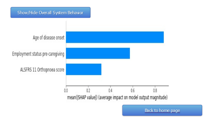
Figure 4. Screenshot of a prediction explained by version 2 of C-ALS.

Higher orthopnoea scores have been found to be associated with higher quality of life in the population. The patient has no breathing problems when lying flat (ALSFRS-R Orthoponea score is 4). This score is associated with lower risk of experiencing poor quality of life (blue bar).