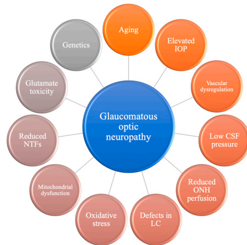
Figure 1. Overview of multifactorial mechanisms contributing to the development of glaucomatous optic neuropathy. CSF, cerebrospinal fluid; IOP, intraocular pressure; LC, lamina cribrosa; NTFs, neurotrophins; ONH, optic nerve head.

20.6 mmHg in the Early Manifest Glaucoma Trial [3]. Moreover, an even lower IOP does not preclude the possibility of glaucoma progression, as the Collaborative Normal-Tension Glaucoma Study revealed that 12% of treated patients experienced disease progression despite a 30% reduction to an average IOP of 10.6 mmHg during 5.6 years' follow-up [5]. In addition, previous evidence has indicated that glaucoma is primarily an optic neuropathy with the optic nerve head (ONH) being the primary site of the disease [6,7]. As a result, more and more ophthalmic researchers have paid attention to investigating biomolecular mechanisms behind neuronal survival and developing further neuroprotective therapies as a supplement to IOP-lowering treatment.