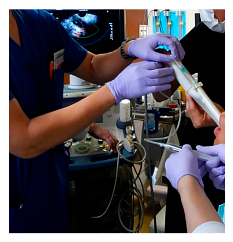
Figure 3. Puncture drainage by transoral pharyngeal ultrasonography (TOPU). Three doctors are performing the puncture drainage with TOPU. The doctor in the right upper side of the image is a neurologist, and he is operating the probe. The doctor on the left side of the image is an otolaryngologist, and he is inserting the needle into the pharynx under ultrasound imaging guidance. Another otolaryngologist is on the right lower side of the image, and he is aspirating pus with the 5-cc syringe.