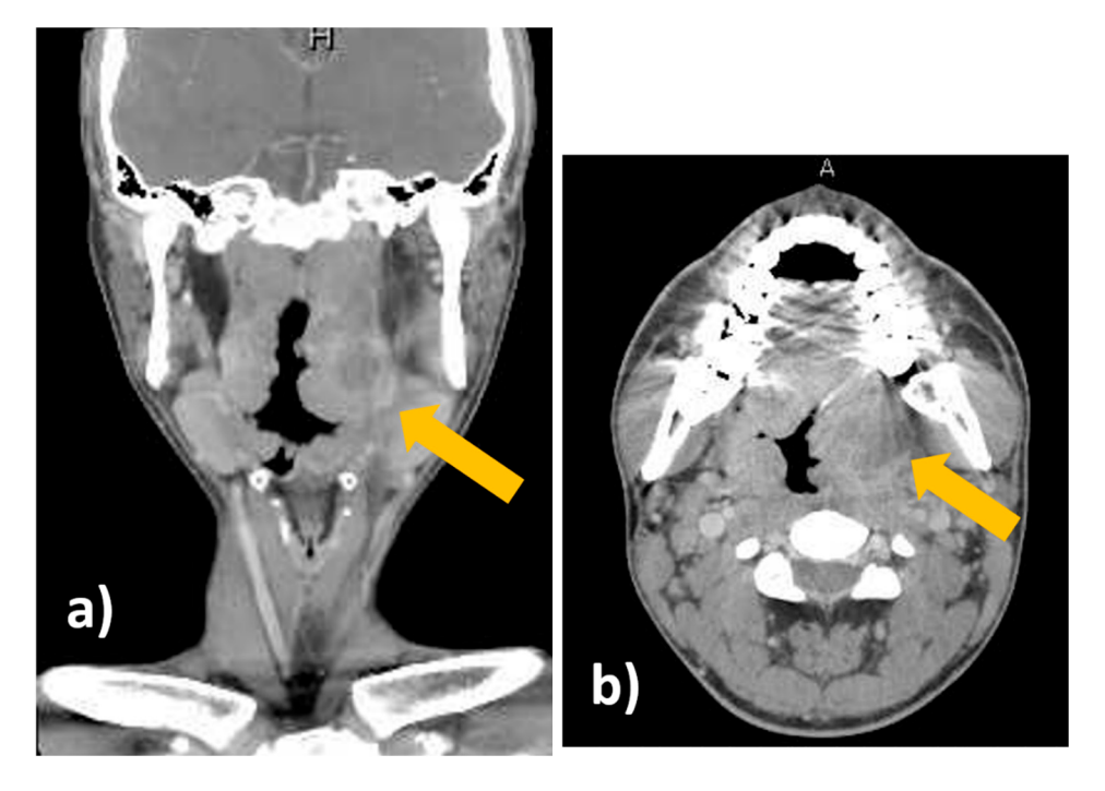
Figure 1. Contrast-enhanced computed tomography. ( a ) Coronal view. ( b ) Axial view. The peritonsillar abscess is indicated by the yellow arrows.