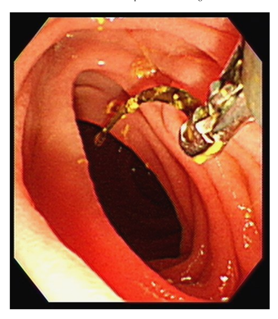
Figure 2. The patient underwent a biopsy, which revealed a 1.7 cm curved, linear, rusty, metallic surgical suture needle containing bile. A retained surgical item poses a hazard to surgical safety and occurs occasionally despite various systems and safeguards [1–3]. Any surgical material, including tools, supplies, and equipment, can inadvertently be left inside a patient's abdomen and can cause subsequent harm to the patient. Several factors increase the risk of the retention of surgical foreign bodies including patient characteristics such as obesity, case-specific conditions such as emergencies, complex surgical procedures, involvement of more than one surgical team, unplanned changes in the procedure, prolonged surgical procedures, and operating room's culture and environment [4]. Intraoperative and postoperative imaging may assist in the rapid identification of the site of foreign bodies, as it did with our patient's retained needle [5]. Although radiography easily detects retained surgical needles longer than 1 cm, the detection of smaller needles less than 1 cm in length is more difficult [6]. Compared with plain radiography, abdominal CT can provide more accurate findings.

at our hospital with right upper-quadrant pain and fever. He had undergone laparotomic cholecystectomy and choledochojejunostomy 28 years prior at another hospital. He had been healthy until 3 days before his admission, when his symptoms appeared. A computed tomography (CT) scan of the abdomen demonstrated abscess over the left lobe of the liver and a linear curve of high-density material within a mass (Figure 1; arrow). The patient received antibiotics and underwent aspiration of liver abscess. Endoscopic retrograde cholangiopancreatography (ERCP) was performed after the symptoms and signs had subsided. ERCP depicted mild dilatation of the CBD and choledojejunostomic fistula of the middle CBD. The patient underwent a biopsy forceps, which removed a 1.7 cm curved, linear, rusty, metallic surgical suture needle containing bile (Figure 2). We examined the patient's abdominal radiographs, which revealed that the needle was on the right side of the third lumbar spine vertebra (Figure 3; arrow). We followed up with abdominal radiography and detected no further evidence of the needle. The patient was discharged without further events.