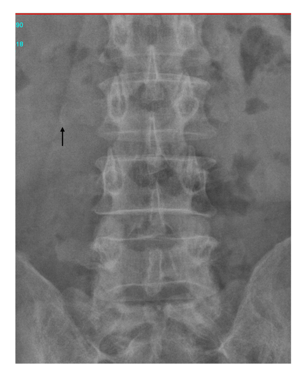
Figure 3. Abdominal radiographs, which revealed that the needle was on the right side of the third lumbar spine vertebra. The symptoms and signs of a retained surgical item include adhesion, foreign body migration, visceral perforation, and abscess formation [1]. These symptoms can occur early in the postoperative period or may develop after months or years [5]. In prior instances, retained surgical suture needles were surgically removed. However, our patient developed symptoms and signs of a retained needle 28 years after his surgery, by which point the needle had migrated to the ampulla of vater, from where it was easily removed through ERCP. Migrated surgical clips, stents, gauze pieces, suture materials, and fragments of t-tubes have all been reported as retained iatrogenic foreign bodies causing CBD obstruction and subsequent sequelae [2]. To our knowledge, this is the first reported case in which a retained surgical needle migrated to the ampulla of vater. Needles comprise 0.06–0.11% of foreign bodies that are retained during surgery [7]. Preventing instances of unintentionally retained surgical materials is a critical problem. A nationwide Brazilian study of retained surgical foreign bodies reported that challenging medical situations, security protocol omission, and inadequate work conditions contributed to retained foreign bodies. Sponges are notoriously overlooked because they are routinely inserted into cavities to expose the operative field. Thus, a preventive protocol could involve the introduction of the use of sponge-holding forceps [8]. In conclusion, CBD obstruction caused by foreign bodies can be safely ameliorated through ERCP without complications noted during follow-up.