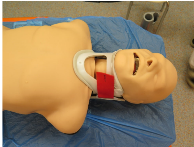
Figure 1. Truman manikin with the neck immobilized using the cervical collar.