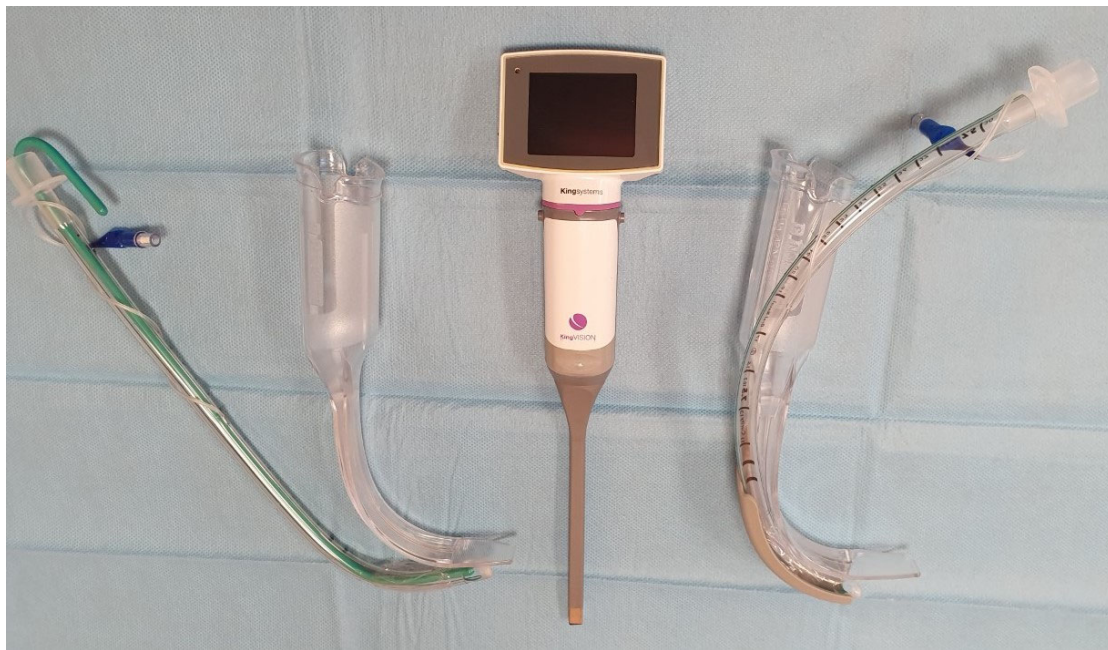
Figure 2. Interchangeable channeled (right) and non-channeled (left) blades of the King Vision™ video laryngoscope. A tracheal tube is preloaded to the guiding channel of the channeled blade, while for tracheal intubation with the non-channeled blade, a curved stylet is inserted into the tube and the vocal cords are approached from the lateral side of the blade.