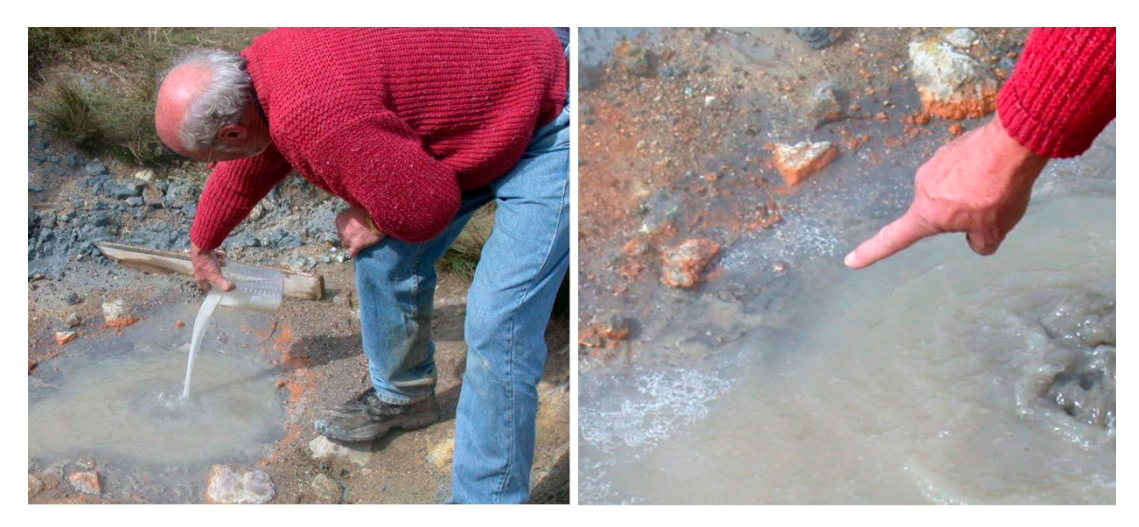
Figure 3. (Left) David Deamer added a "prebiotic soup" to a boiling pool in the Dachnoye thermal field on Mount Mutnovsky, and (right) points to the white froth of fatty acid membranes that immediately appeared around the edges. The pool was sampled over time and later analyzed. Surprisingly, all of the added solutes except the fatty acid were bound to the clay minerals, an observation that has implications for the fate of organic compounds in similar settings on the prebiotic Earth.

On 7 September 2004, a preliminary experiment was performed in which biologically important organic compounds were added to a natural hot pool (Figure 3). The experiment was inspired by Charles Darwin's conjecture that life might have begun in a "warm little pond" so we jokingly referred to the pool as Darwin's hot little puddle. The pool was approximately 0.7 \times 0.7 meters with an estimated volume of 7 liters. The pH was 3.1 and the temperature at the boiling center was 97 °C. The pool was lined with a layer of grey clay mineral several centimeters deep. This was disturbed by the boiling which caused constant stirring and turbidity.