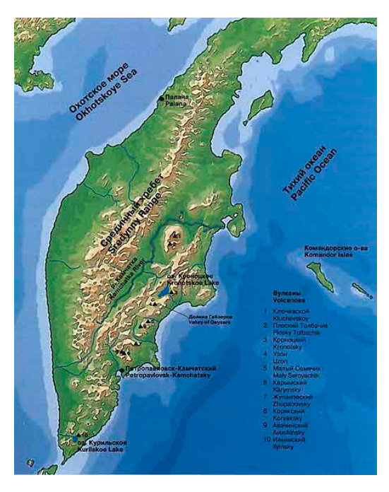
Figure 2. Map of the Kamchatka peninsula.

The Kamchatka peninsula is situated in northeastern Russia and spans a region of approximately 400 by 1200 km (Figure 2). The region contains 30 active volcanoes and approximately 270 hydrothermal fields. The most intensive hydrothermal activity traces a narrow zone along the axis of deep faults that cross the volcanic belts of eastern and central Kamchatka, with a breadth ranging from 30 to 50 kilometers. Over the years, hydrothermal processes in this area have attracted the attention of a number of Russian scientists [2–6].