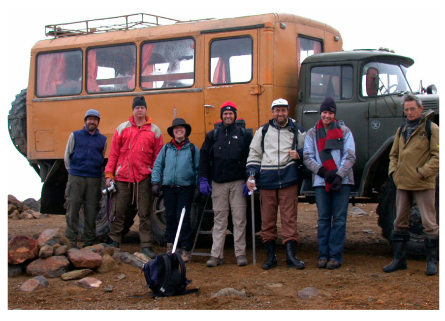
Figure 1. Participants on Mount Mutnovsky, September 2004.

the origin of cellular life [1]. I will now briefly describe the main results of my studies of Kamchatka hydrothermal sites.