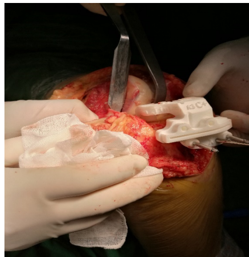
Figure 2. Intraoperative application of 3D printing template.