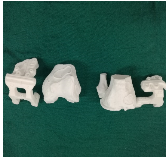
Figure 1. 3D printing pre-operative template.