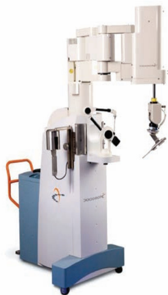
Figure 3. ROBODOC.

At present, several robotic-assisted arthroplasty surgery systems have been developed in the United States, Japan, Israel, and the United Kingdom, including the MARS surgical system developed by the Research Office of Mechanical Engineering Department in Israel [33], the 7-degree-of-freedom MIS-UKA system for robot-assisted orthopaedic surgery developed in collaboration with the University of Tokyo and Chiba University in Japan [34], and the ROBODOC (Figure 3) robot system developed by Integrated Surgical Systems Company in the United States [35]. Similarly, MAKOpasty is a semi-autonomous robotic system based on CT scanning and visual navigation developed by MAKO (Figure 4) [36], and ACROBOT is a semi-automatic TKA system developed by Imperial College Mechatronics in Medicine Laboratory, UK [37].