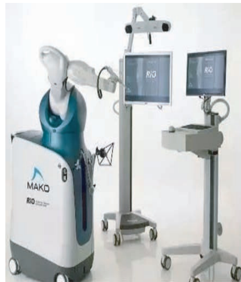
Figure 4. MAKO.

ROBODOC robots were first introduced for TKA in 2000, received FDA approval in 2008, and were renamed THINK robots in 2014. In addition to the ROBODOC and MAKO systems, there are also the NAVIO and iBlock systems. NAVIO is a handheld robot that can be manipulated by a surgeon [32]. The system was first approved by the FDA in 2012 for unicondylar replacement and patellar replacement and is now available for TKA. It does not require preoperative CT images and serves as an open robotic assist system for different prostheses from different manufacturers [32,38].