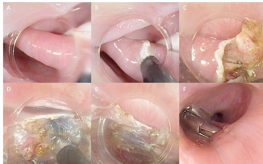
Figure 3. Technical steps of the hybrid technique myotomy for ZD treatment: (A) ZD view with a nasojunal tube in the esophageal lumen used as a landmark; (B) First incision of the septum; (C) Initial septotomy with a freehand technique; (D) Submucosal injection to better distinguish submucosal and muscular layers; (E) Continuing the septotomy, repeating injection when necessary; (F) Final closure with endoclips.