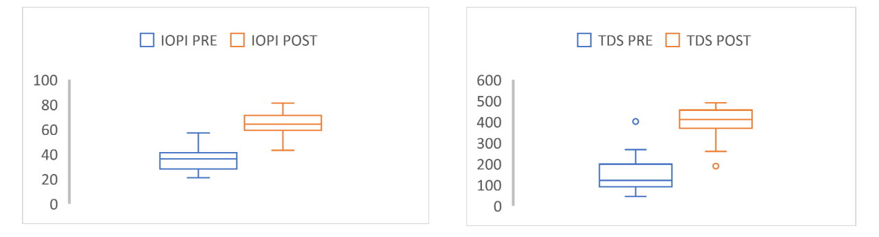
Figure 2. Box plot showing statistically significant changes before and after MT treatment with the Airway Gym<sup>®</sup> app during 3 months in IOPI and TDS.