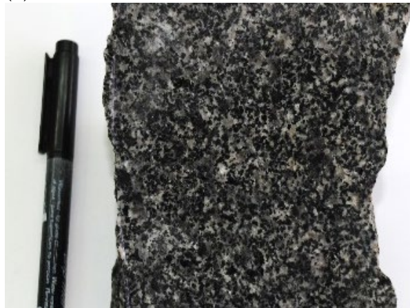
Figure S1. Hand specimens' photographs of Maronia monzodiorite samples (a,b).