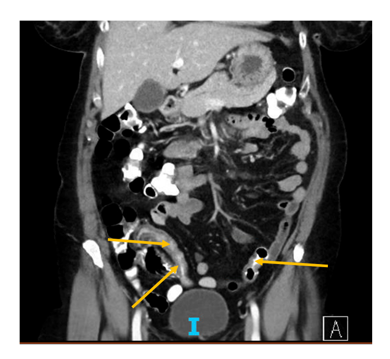
Figure 2. CT of abdomen and pelvis showing sigmoid colon thickening (arrows).

The patient was treated with our initial COVID-19 hospitalization protocol during the pandemic, which consisted of a course of hydroxychloroquine 400 mg daily, azithromycin 250 mg daily, and ascorbic acid 500 mg daily for 5 days. The laboratory trend of her inflammatory markers are summarized in Table 1. Supplemental oxygen was required for only two days. She defervesced after day 4 of hospitalization. She was discharged on hospital day 5 and asked to hold her immunosuppression for two weeks. The patient had felt well during her follow up with her gastroenterologist 2 weeks later.