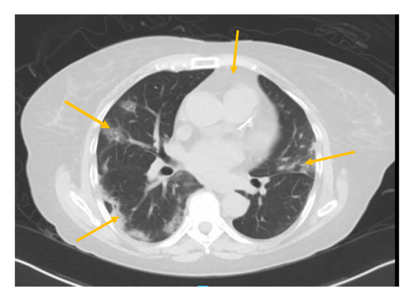
Figure 1. CT of chest showing patchy consolidations in peripheral distribution and pericardial effusion (arrows).

While admitted, she experienced persistent fevers, (T max of 102.4°F), and worsening shortness of breath with desaturations to 87% on room air, which were corrected with 2 L of supplemental oxygen via nasal cannula. A CT scan of the chest (Figure 1) found patchy consolidations in a peripheral distribution scattered throughout the lungs, consistent with known COVID-19 infection, and a small anterior pericardial effusion. A CT scan of the abdomen and pelvis with oral and IV contrast (Figure 2) showed wall thickening in the proximal sigmoid colon, representing colitis. Stool testing for Clostridium difficile was negative and a fecal calprotectin test was normal at 19.