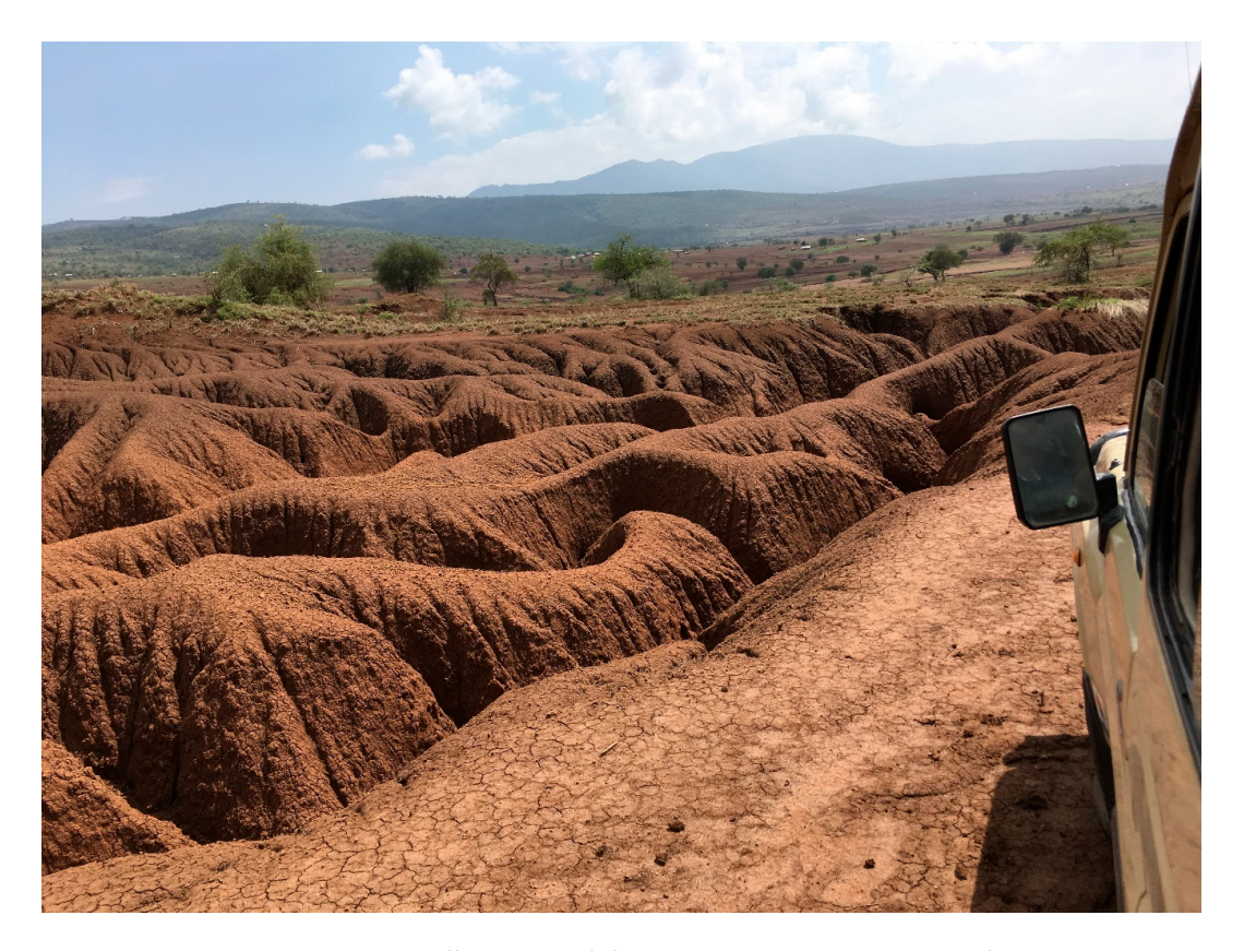
Figure A1. Severe gullying, Monduli District, Tanzania.