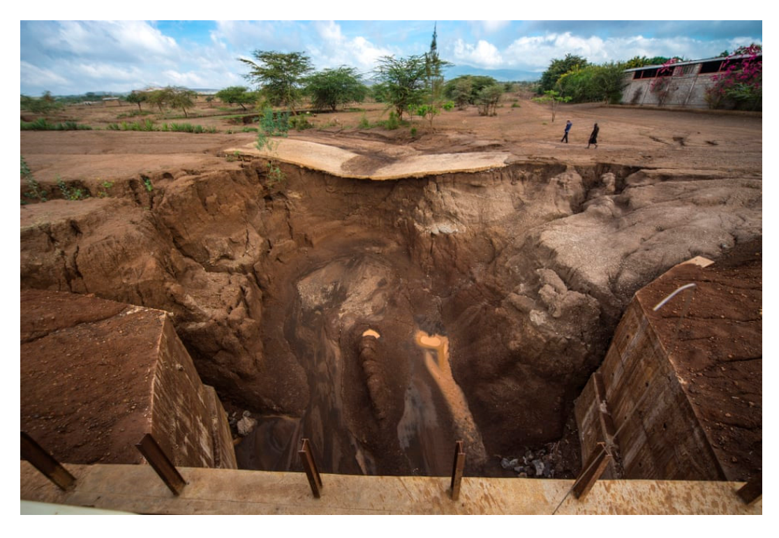
Figure A2. Impacts of soil erosion processes on community infrastructure.