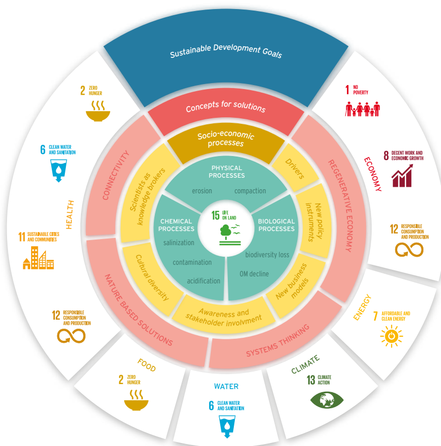
Figure 3. Schematic view of the linkages between the Sustainable Development Goals, societal challenges, concepts in soil, land and water management, and indicators and processes in the biosphere (biological, chemical, and physical processes).

Placing this example in the framework presented in Figure 3, it becomes obvious what went wrong. The chosen land management only focusses on one thing: making more profit in the short term. The land management strategy does not make use of the soil functions and damages the physical, chemical, or biological processes in the soil. The industrial farming on large plots does not use the concepts we introduced in Figure 3. The large plots enhance the connectivity of water and sediment, facilitating large-scale erosion. Furthermore, the engineered farming system based on fertilizer and herbicide use does not consider the forces of nature that can be used to sustainably farm. When we want to turn around this type of farming, options for sustainable nature-based land management need to use process knowledge embedded in the concept of connectivity. At the same time, however, the economic concepts we introduced must provide the incentive to make more sustainable land management an economically and socially viable option (farmers motivations [81]).