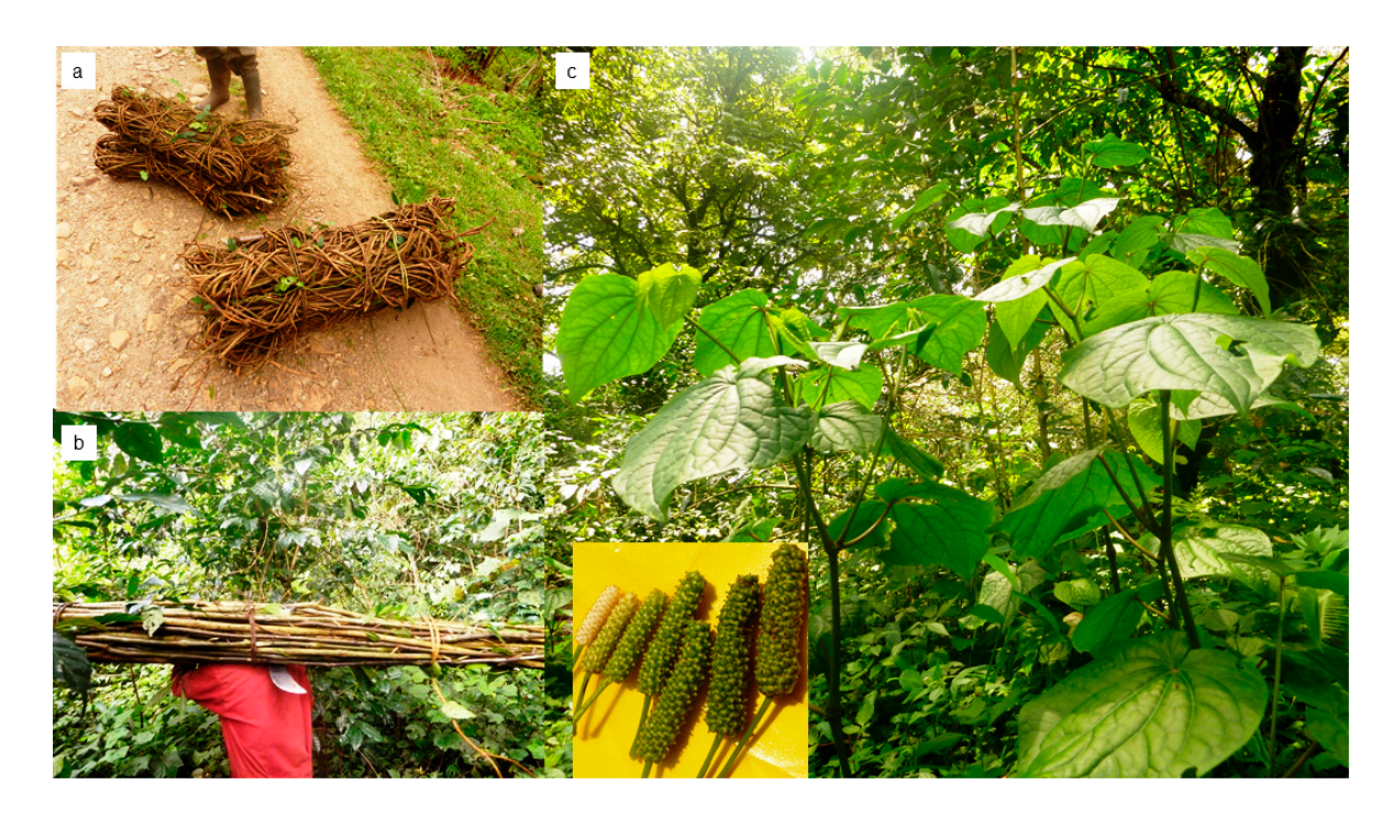
Figure 2. (a) Lianas; (b) young, strong and straight wood for live fences; and (c) Piper capense spice that the farmers collect from forest and forest coffee ecosystems in the Gera district of Ethiopia.