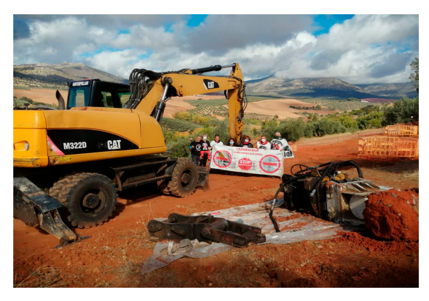
Figure 4. Photography of the gathering of the platform "Say No to Towers" (Di No a las Torres) in Altiplano de Granada in 2020.

Subsequently, in July 2020, the Platform "Say No to Towers in Altiplanos and Geopark" (Di No a las Torres en los Altiplanos del Geoparque) was created in response to the construction of the 400 kV high-voltage line between Baza and Caparacena, the 400 kV substation in Baza and the wind and photovoltaic megaprojects that threaten these territories. Here again, the interviews and workshops show the resistance process that also includes assemblies and mobilisations in the sacrificed territories and joint demonstrations with the platform "Say No to Towers" (Di No A Las Torres) in the Lecrín Valley and Alpujarras as it can be seen in Figure 4, and also demonstrations organised with other organisations such as Environmentalist in Action (Ecologistas en Acción) in 2021.