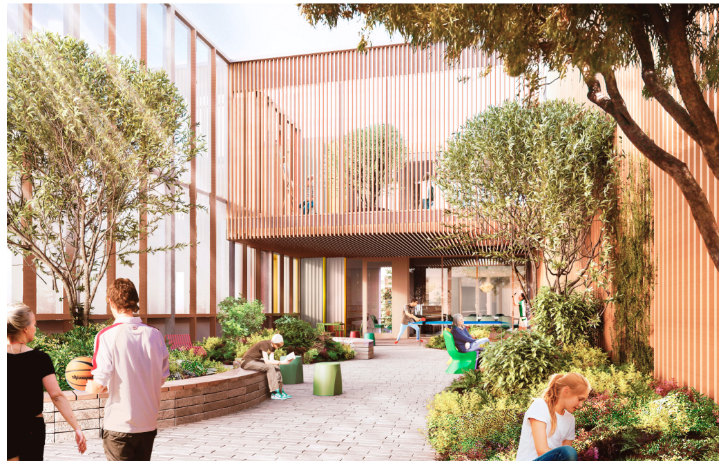
Figure 3. Visualisation of the interior and exterior of Cambridge Children's Hospital design. (Image courtesy of Hawkins\Brown and White Arkitekter).

This review has identified several case studies that demonstrate the potential benefits of healing gardens for various individuals in healthcare settings. The benefits extend beyond just children, and include patients, staff, and visitors. Healing gardens can lead to improved health and wellbeing, as well as cost savings for hospitals and health systems, as shown in studies conducted by Cordoza et al. (2018) [113], Grahn et al. (2017) [114], and Stigsdotter and Grahn (2003) [115].