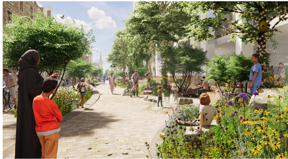
Figure 2. Proposed Green Infrastructure for Child-Friendly Environment at Great Ormond Street Hospital. (Image courtesy of LDA Design).

The previous study is evidence that implementing green infrastructure such as healing gardens, as a strategy to reduce pollution, is a practical application as it is an ongoing project. Subsequently, the benefits of healing gardens can be extended from children's wellbeing to climate action, as described by Sustainable Development Goal 13 [97], for the environment, thus working towards current United Nations goals and presenting healing gardens as a viable feature for hospitals.