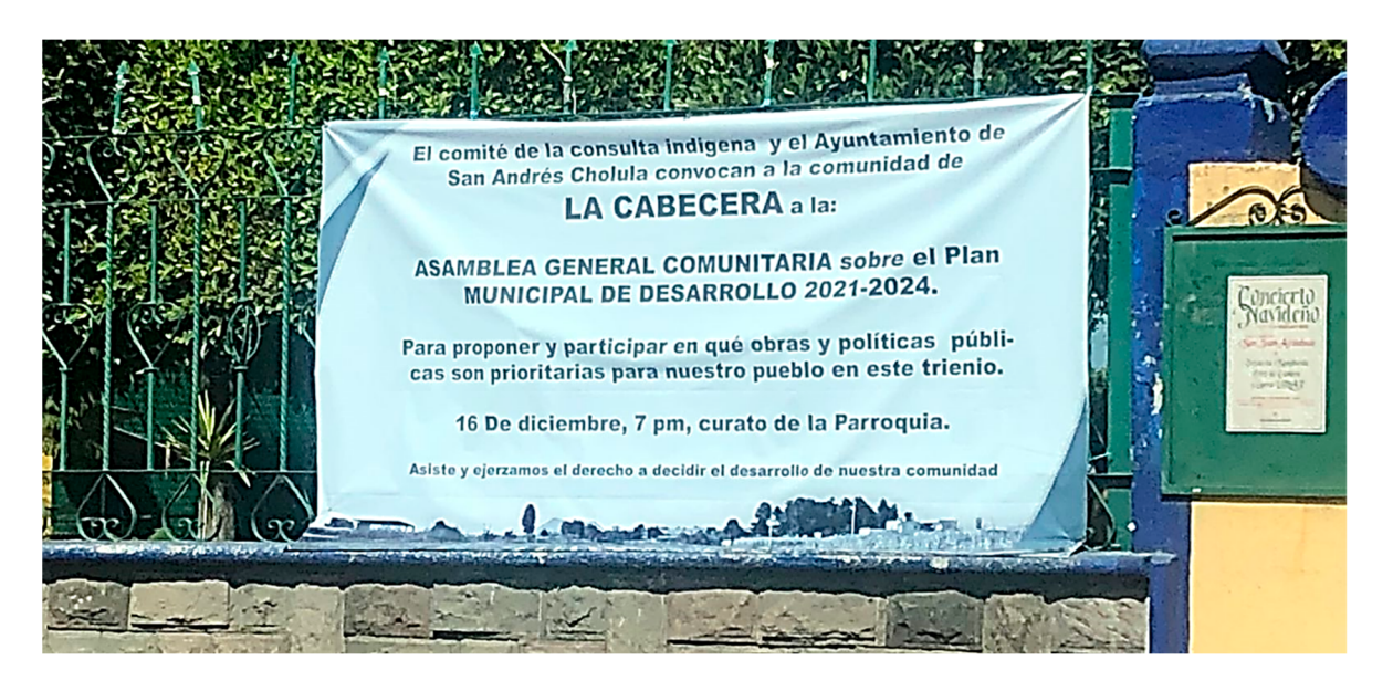
Figure 2. The general assembly call a consultation for the new municipal development plan of San Andrés Cholula. Billboard located in the church of San Juan Aquiahuac.