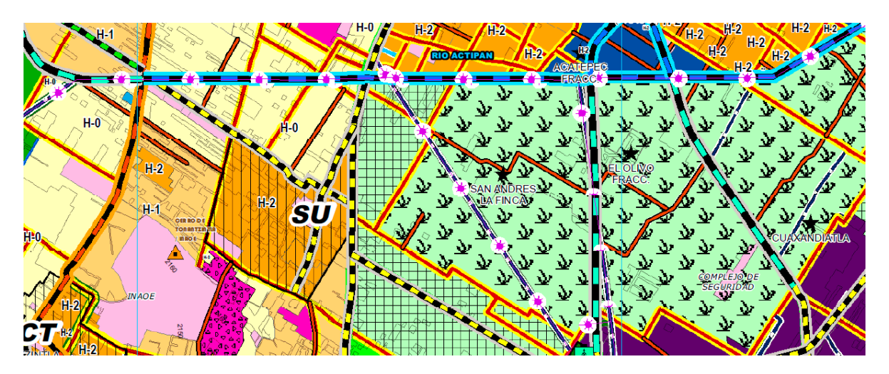
Figure 4. Land uses and densities in San Rafael Comac, Source: MPSUD (2018).

such as (Figure 4): (a) the expansion of streets and roads, crossing properties, homes and other relevant buildings for the community, such as churches; (b) the construction of gated communities, including skyscrapers, which would affect the traditional landscape and would lead to the depletion of natural resources to the detriment of the community organization, health and subsistence; (c) the modification of land uses from agricultural to residential, constituting an economic burden for the villagers due to increasing taxes that make agricultural activities unsustainable [35,36].