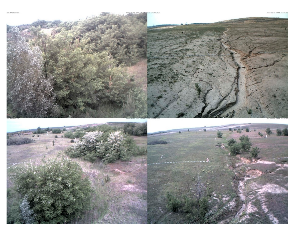
Figure 2. View north over the Hühnerwasser catchment area, from a webcam mounted at 6 m height. The date of each photo is June, clockwise from top right—in 2008 ( top right ), 2011 ( bottom right ), 2015 ( bottom left ), and 2018 ( top left ).