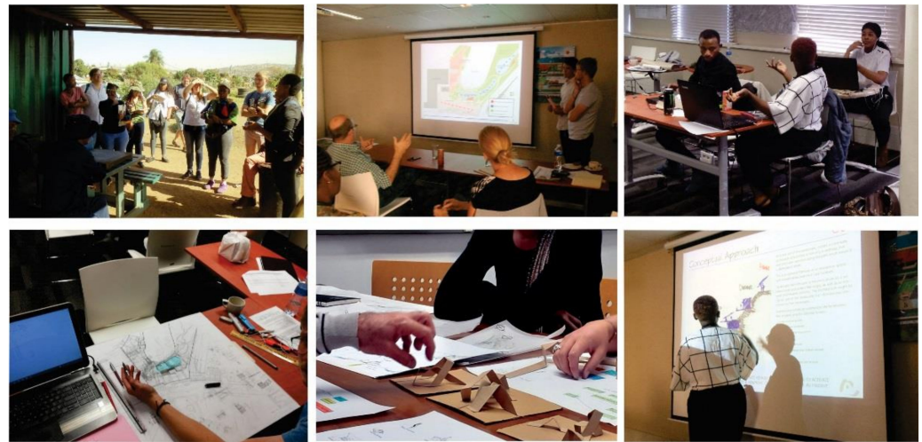
Figure 7. Workshop activities and discussions between the community, municipal staff, and students during the student visit to eThekweni (top) and back in Pretoria (bottom).

The Department of Architecture at the University of Pretoria operates within a studio-based design learning paradigm where critical discussions are used to point out the strengths and weaknesses in the students' work. Precedent studies are also used as a way to find possible solutions that must then be adjusted to the local social and environmental context. On return to Pretoria, the responsible lecturers gave weekly critique to the students on their design progress. Midway through the design process, staff from eThekweni came to Pretoria to provide their input to the students' design developments (see Figure 7).