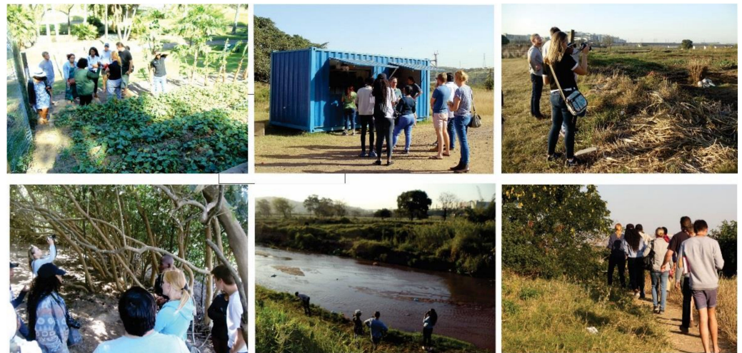
Figure 6. Meaningful field trip activities, such as site and case study visits, arranged by the municipal staff for the students during their visit to eThekweni.

As part of the workshop, two site visits to the Piesang's River and KwaMashu (see Figure 6), on-site engagement with the residents under the guidance of the municipal team (see Figure 7) and guided visits to two examples of best-practice urban parks in Durban were conducted. Private and public consultants explained the challenges of each example to the students and discussed the design decisions they had selected to respond to them and how successful or unsuccessful these decisions were. Students could then physically inspect the project and take note of how activities and amenities were grouped and what materials and construction details were used. The students spent the last two days working on conceptual design ideas and presented these to the municipal staff for initial feedback.