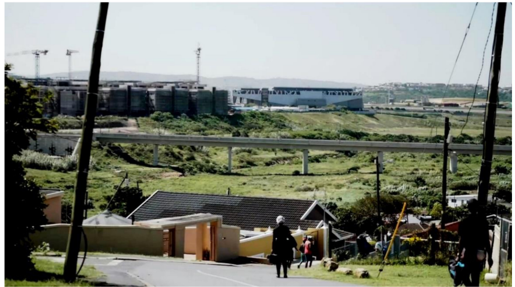
Figure 2. View from the KwaMashu residential area towards the new Bridge City development taken across the Piesang's River flood plain. Only the train bridge crosses the vast wetland that has become an insurmountable barrier to pedestrians.

One of the challenges for the Bridge City development has been precisely the crossing of the Piesang's River flood plain [61]. Over a length of nearly 2 km, there is no pathway or pedestrian bridge over the Piesang's River to allow the population of old-town KwaMashu to safely cross the river and steep slopes to reach the facilities of Bridge City [65]. Additionally, part of the protected biodiversity of the Durban MOSS green space is in a state of neglect and is perceived to be a dangerous, no-go area (see Figure 3).