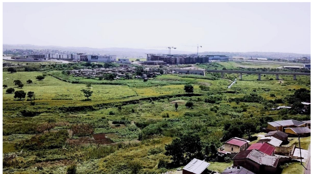
Figure 3. The Piesang's River flood plain, viewed from KwaMashu towards Bridge City. Urban agriculture can be seen in the foreground, with the cemetery in the middle left.

One of the challenges for the Bridge City development has been precisely the crossing of the Piesang's River flood plain [61]. Over a length of nearly 2 km, there is no pathway or pedestrian bridge over the Piesang's River to allow the population of old-town KwaMashu to safely cross the river and steep slopes to reach the facilities of Bridge City [65]. Additionally, part of the protected biodiversity of the Durban MOSS green space is in a state of neglect and is perceived to be a dangerous, no-go area (see Figure 3).