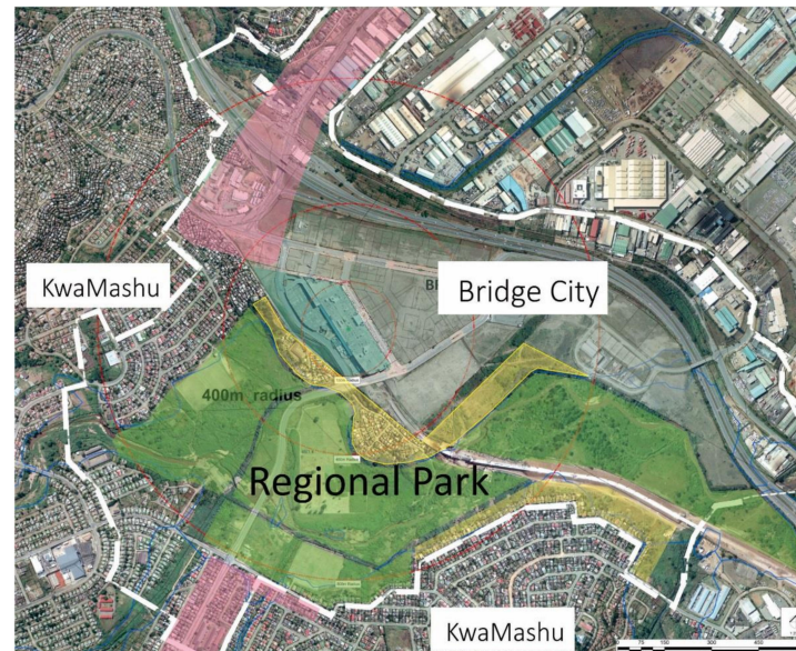
Figure 1. An aerial photograph showing the Bridge City KwaMashu Open Space Project as a “regional park” that is located within the KwaMashu Urban Hub Project.

The KwaMashu Urban Hub Regeneration Project covers approximately 1500 ha with about 135,000 inhabitants (see Figure 1). The population size of the Regeneration Project is similar to urban centers in sub-Saharan Africa (less than 250,000) that accounts for 140.7 million urban dwellers [64], thereby providing scope for learning by other African urban centers of similar size and deprivation levels. The greater project area houses nearly one million inhabitants, which is almost a quarter of the greater eThekweni's marginalized resident population [65]. The Regeneration Project includes visions for a consolidated commercial node and enhanced public transport interchange zone, along with existing residential and industrial precincts [61]. Officially launched in 2007, the Bridge City development is still on its way. Key grey infrastructure, such as a train station, as well as a mall and a hospital, have been built and are meant to attract further investment.