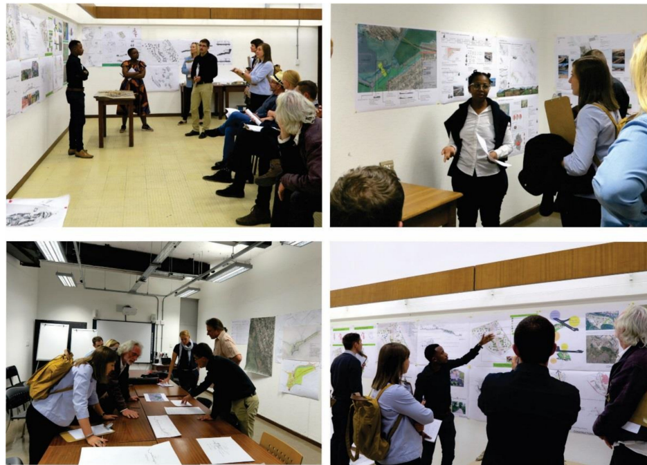
Figure 8. Students, questioned by external examiners, defend their design proposals on the Piesang's River Park in the presence of the lecturer and municipal staff during the final examination for the quarter-year project.