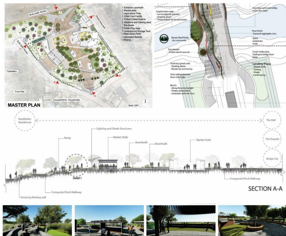
Figure 9. A collage with selected design work from the students that was shared with the eThekweni Municipality. The top left and middle images feature a linking market space on a steep slope to Bridge City. The top right and bottom images feature a pedestrian bridge crossing the Piesang's River with recreational lookout points.