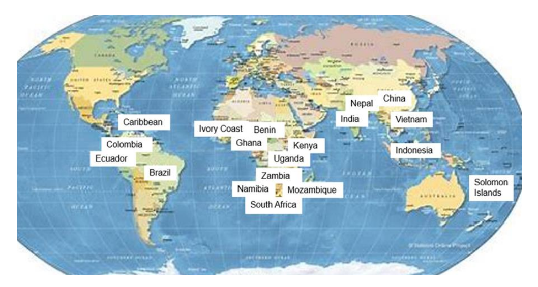
Figure 2. FFPLA Country assessments and implementations addressed in this Special Issue.

In recent years, the FFPLA concept has been introduced in many countries throughout the world for providing secure land rights at scale, within a short timeframe and at affordable costs. Figure 2 shows the range of countries where FFPLA assessment and implementation are addressed in this Special Issue.