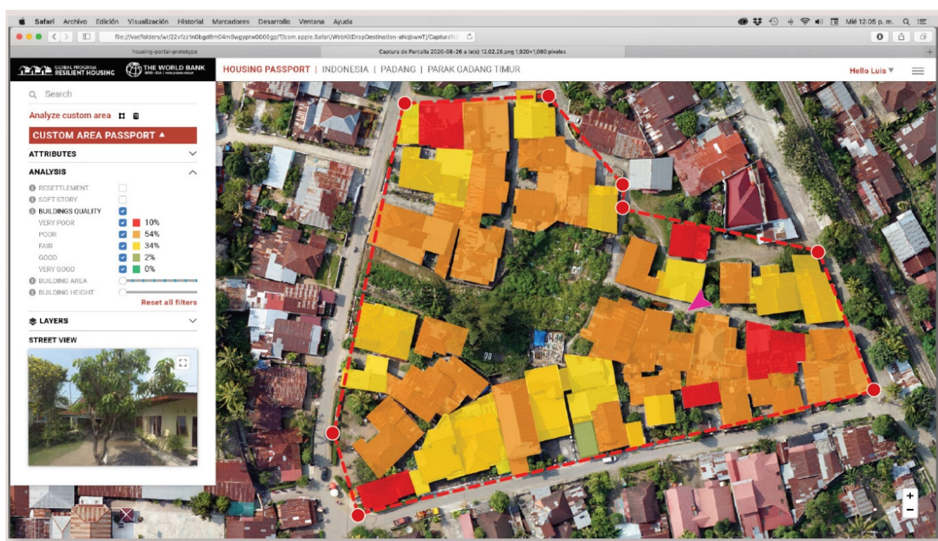
Figure 2. Results of building quality assessment, Penang, Indonesia.

The key product derived from street level imagery to support the FFP land tenure methodology is the georeferenced street panorama. Although FFP land tenure can be completed using just drone imagery, the georeferenced street panorama derived from street view imagery can add further support to the FFP land tenure process. It can be used to perform measurements, help interpretation of the urban landscape and support allocation of street addresses. However, the street view imagery supports ML to extract building