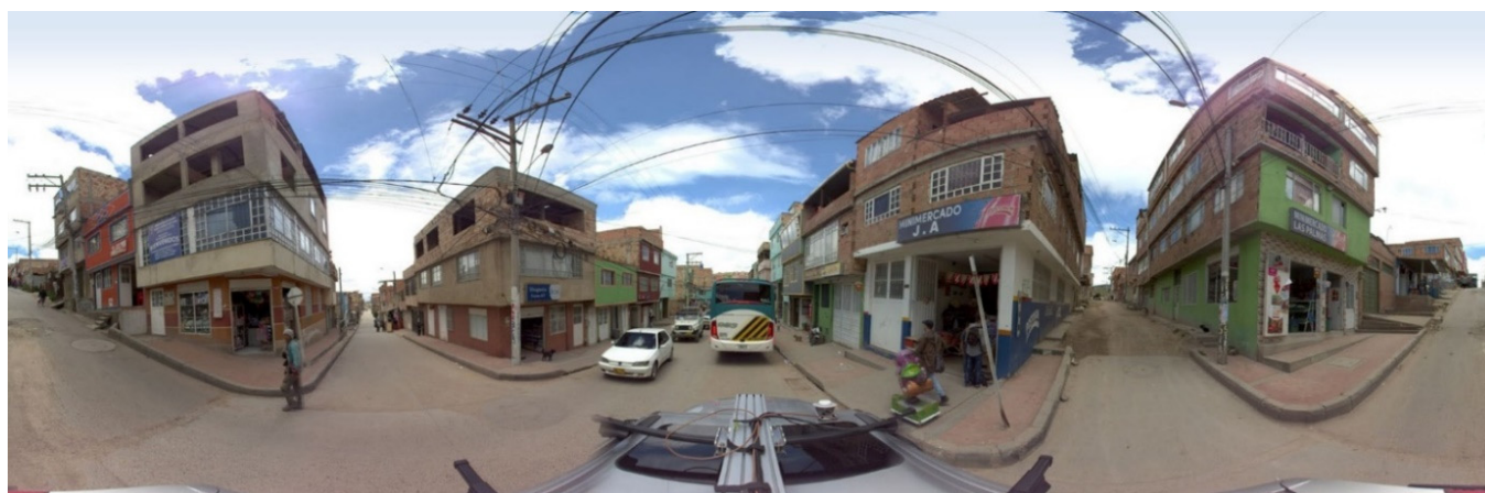
Figure 3. Street view panoramic from Colombia.