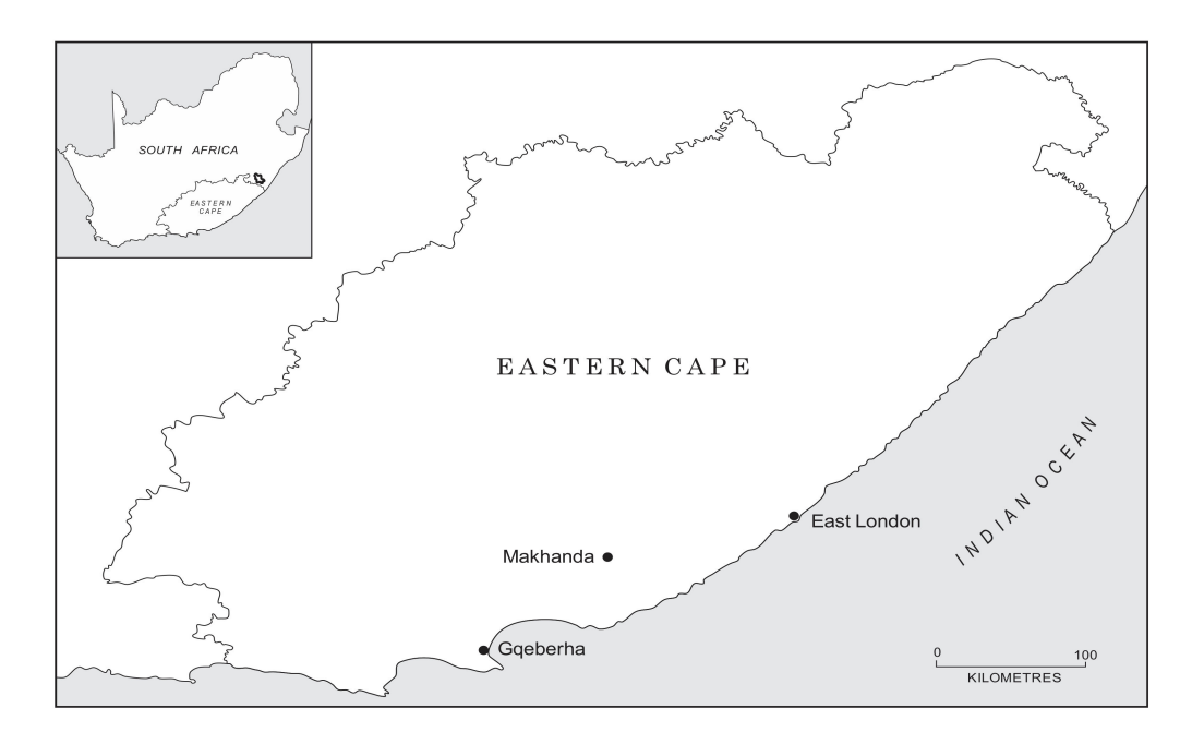
Figure 1. Location of Makhanda in the Eastern Cape province of South Africa.

Makhanda is a medium-sized town of about 70,000 people, located (33°18'36" S; 26°31'36" E) in the Eastern Cape province of South Africa (Figure 1). At an altitude of about 550 m, the town has a warm and temperate climate and is highly susceptible to drought, mirroring evidence of the widespread occurrence of droughts and persistent drying conditions in the country [18]. It has mean temperatures of around 27 °C in summer (October to March) and 19 °C in winter (May to July) months [25]. Mean annual rainfall is about 600 mm per year, with peaks in the summer months October and November and March and April due to frontal rainfall, but rainfall variability and droughts are common. The dominant biome in the town is the sub-tropical thicket, specifically grassland or xeric succulent thicket [26]. Because the town is surrounded by several mountains, patches of South Coast Renosterveld, Afromontane forests, grasslands, and Nama Karoo surround the town [26]. The town is underlain by rocks of the Cape and Karoo supergroup [27].