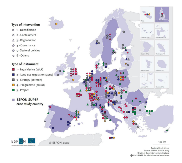
Figure 3. The localization of the SUPER intervention throughout Europe (source: [25] (p. 35)).

As mentioned, each intervention was qualitatively assessed in relation to its success in promoting a more sustainable use of land. This assessment phase was based on the responses of the country experts to the online survey and further verified through desk research (e.g., analysis of scientific articles and reports retrieved through the web). By crossing the level of success with the other variables, it was possible to reflect on which goals and which types of instrument have been more successful, and to further explore the reason behind the success [3] (p. 4). In particular, as shown in Table 3, for each category of the chosen variable, the interventions show varying degrees of success in relation to their ability to achieve a more sustainable urbanization.