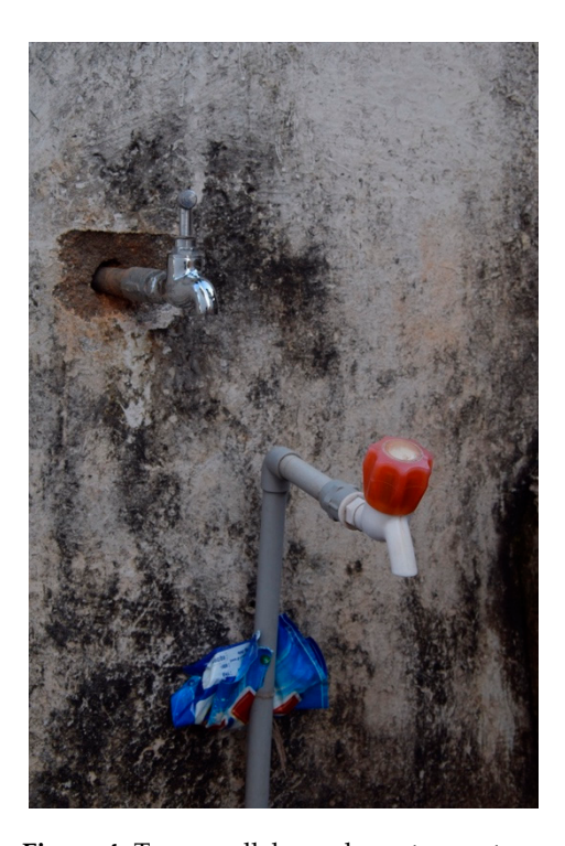
Figure 4. Two parallel supply systems—two water taps per household.

The water supply to households was in a transformative stage during our visit. Under the "Mission Bhagiratha" Telangana state aims at providing 100 L of piped treated drinking water to households in rural areas [118]. In March 2019, the pipelines were being laid in the village, but there was no water in the pipes yet. Thus, the population was still relying on the supply from the gram panchayat, sourced from the local tank. Each household got two hours of water supply on every second day. The water has to be stored by each household individually, so one finds plastic barrels and other storage facilities in front of almost every house. Parallel to that, there is a drinking water supply, delivering treated water from river Krishna to public standposts. Water is available here between one to two hours daily. Thus, for households two parallel water supply infrastructures are in place and a third is in the making (Figure 4).