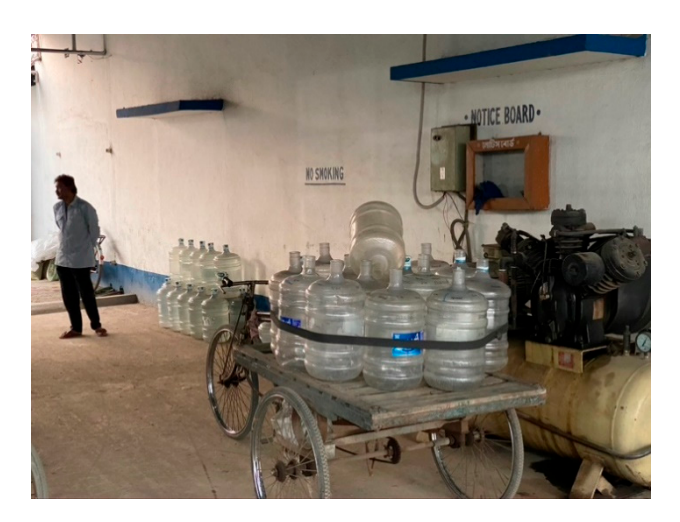
Figure 7. A water-vendor collecting jars at the licensed RO-plant.

In Badai, there are three different sources of drinking water: some households still rely on the traditional hand pumps, others get their water from public stand posts and some buy RO water. A large, government certified bottling plant sells 20-L jars, which are delivered by small, informal vendors, who buy the water from the plant and earn their living from the delivery (Figure 7). Piped water is provided to the stand posts by the Public Health Engineering Department of the West Bengal Government. Untreated groundwater is available here three times a day for one and a half hours. Especially in the summer months respondents reported shortages of domestic water, mainly for those who rely on their own hand pumps, because of ground water depletion.