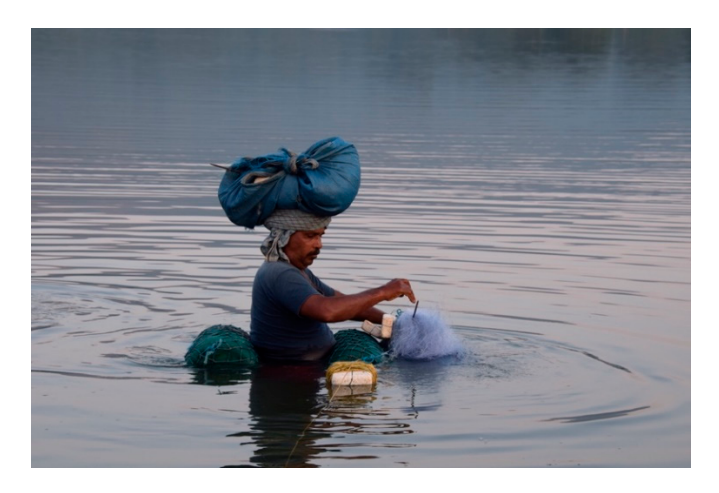
Figure 2. Fisherman in Paud.

There are three traditional water-based livelihoods, which are affected by periurbanisation: fishing, farming, and pottery. Members of the fishing community (Figure 2) highlighted how their livelihoods have changed, as their access to water bodies was restricted. Especially accessing the dams in the Western Ghats has become difficult, as the government decided to auction the right to fish in the dams. As the fishermen cannot pay the same prices as financially potent outsiders, they were excluded from some of their traditional fishing grounds. Now they have to travel longer distances for fishing and their income is stable or decreasing. These institutional changes result in skepticism regarding the sustainability of their livelihood on side of the fishermen.