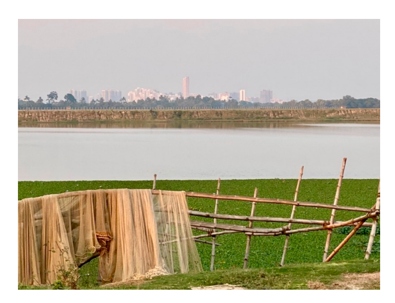
Figure 6. View of the largest tank of the fishing co-operative with a vista of Newtown, a satellite city of Kolkata.

domestic purposes. For drinking water most villagers rely on RO water, which is delivered by local water vendors.