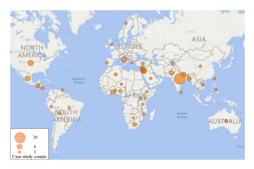
Figure 1. Geographic distribution of intermittent water case studies found in the literature [1–129].

Notes: <sup>1</sup>: A single article could examine communities with multiple sources of water; <sup>2</sup>: Such as surface water (dam and river) that was collected by household members.