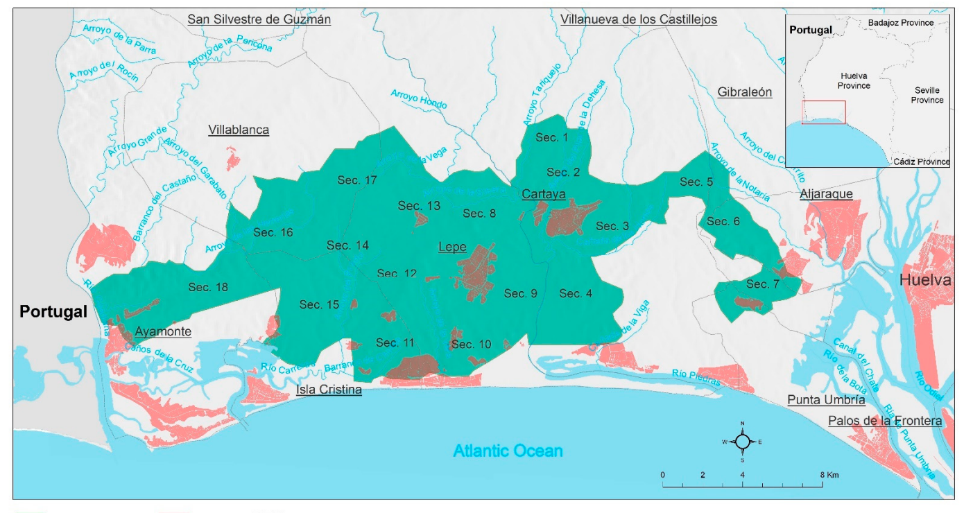
Chanza Irrigated Area Urban Area Local Division Sec. = Irrigated Sector