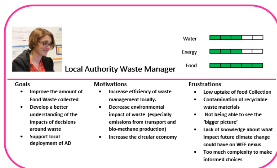
Figure 1. Example of a Persona developed for the Stepping Up project Decision Support Tool.

In depth thematic analysis of the interviews and workshops with the various stakeholders was carried out and themes were identified (using NVivo software). This helped to identify interconnections and gave us a much deeper understanding of the issues around the implementation of the different innovations and the Sustainability Indicators that could be used to support decision making. Table 2 below shows the Sustainability Indicators chosen, the different categories they were placed in, if they were a driver or a barrier to the chosen innovations and if the desired benefit would be an increase or decrease in the indicator measurement.