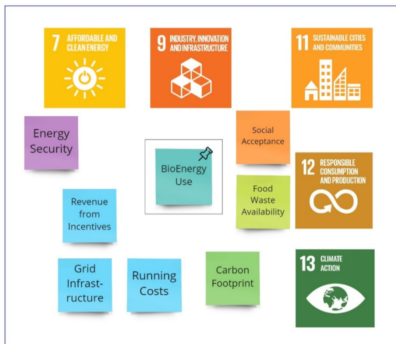
Figure 2. Card sort image for achieving connections with other SIs and the SDGs relating to Bio-energy use from Anaerobic Digestion.

The next and final step was to develop the Visualisation in a way that captures the various sustainability indicators from the many identified points of view in a cohesive and visually accessible way, which allows for inquisitive exploration. The finished interactive tool can be found at: https://nikpanayotov.github.io/steppingup-indicators-catalogue/ (accessed on 05 May 2020).