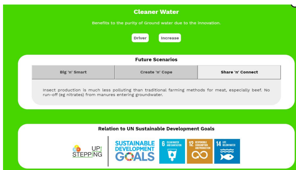
Figure 4. Example of Single Sustainability Indicator (SI) display for Future Scenarios & Relationship to SDGs—Cleaner Water.