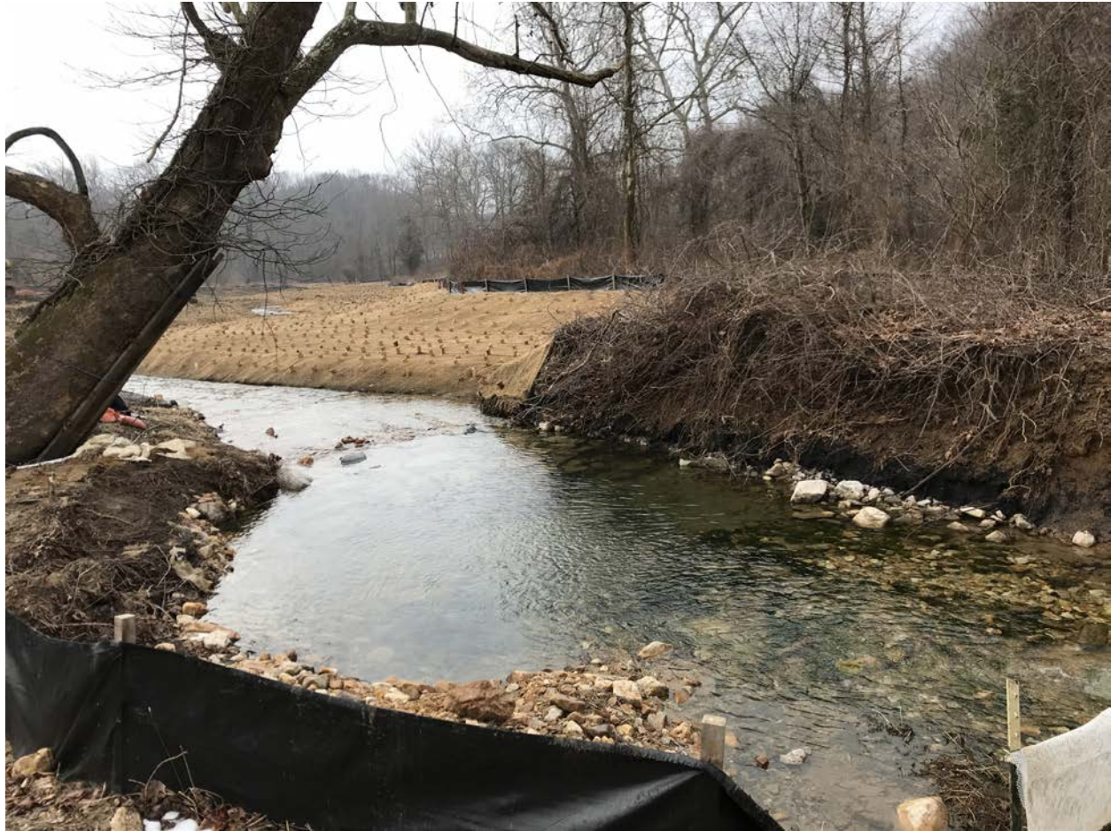
Figure S2: Partial construction/transition along Phase 2 showing restored (left) and unrestored (right) reaches. The junction represents a construction pause for the no-instream work period – March 1 to June 15. Note the height of the incised vertical bank and the buried organic horizon on the right, and the newly created wider floodplain on the left. White, Pleistocene era gravel can be seen below the dark organic horizon on the right.