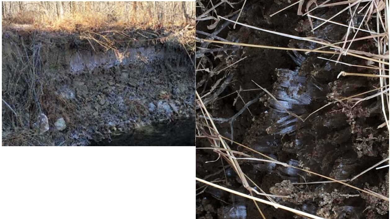
Figure S3: Streambank at Gramies Run (along Phase II restoration, same reach as in Figure S2) showing freeze-thaw drool and subaerial erosion following freeze-thaw conditions in winter.