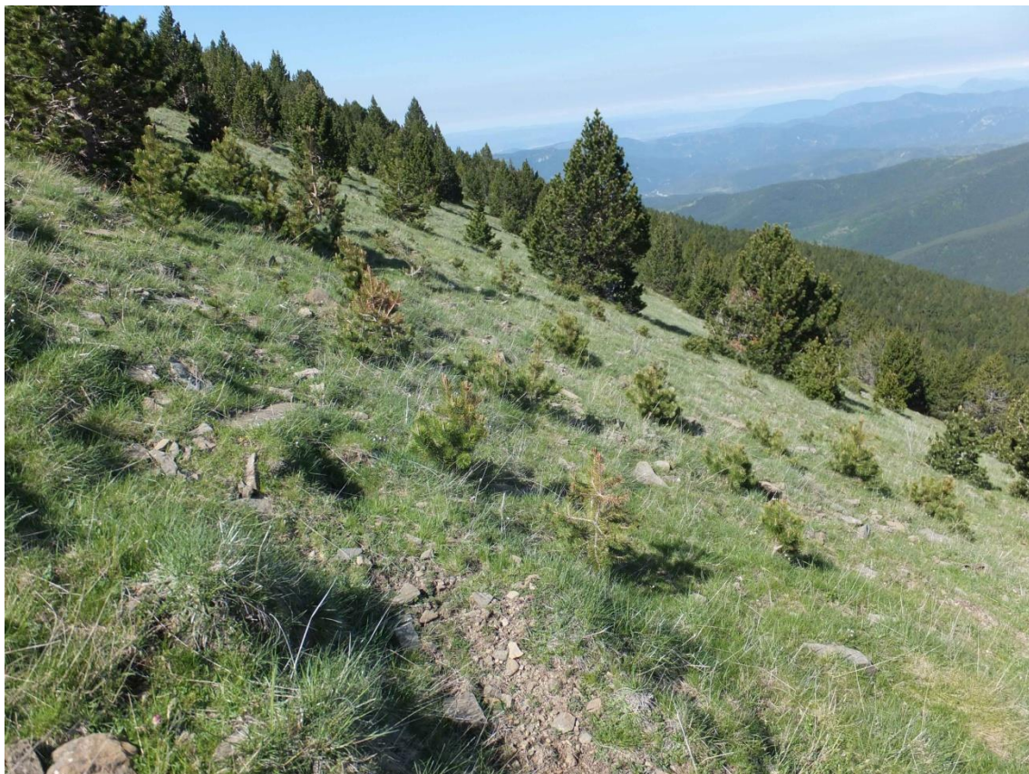
Figure 3. Recent colonization by P. Uncinata in the subalpine belt in the Spanish Pyrenees (Las Blancas), as a consequence of a decline in livestock grazing (particularly sheep). The taller trees are 20 years old and the small trees are 3–4 years old.

matter due to vegetation favors soil development [84] and a consequent increase in long-term soil water storage. There is evidence that transpiration of old trees is lower than that of young individuals [85], suggesting that the impact of revegetation on runoff may stabilize or even decrease over time. In some cases, after decades of abandonment, degradation of shrub cover due to senescence has been observed, indicating a possible increase in runoff and sediment yield in the long term [41]. All these questions highlight the need for further research based on long-term data series in order to detect trends and changes in the system response.