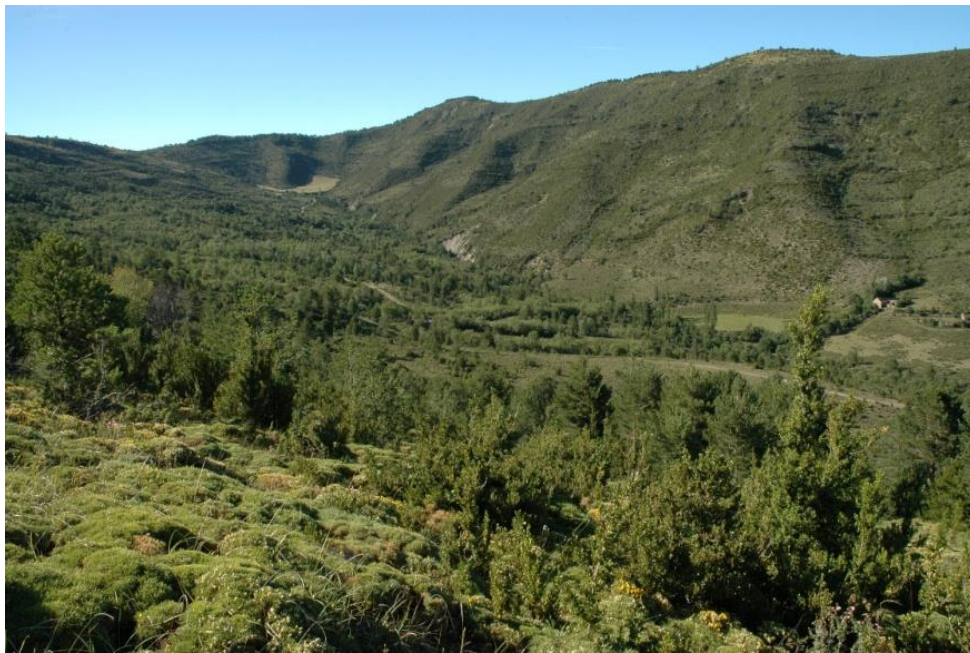
Figure 1. Plant colonization in abandoned fields in a wet environment (Arnás catchment, Central Spanish Pyrenees). Forest stands occupy the gentle slopes in the forefront whereas the steep slopes in the background are colonized by shrubs.