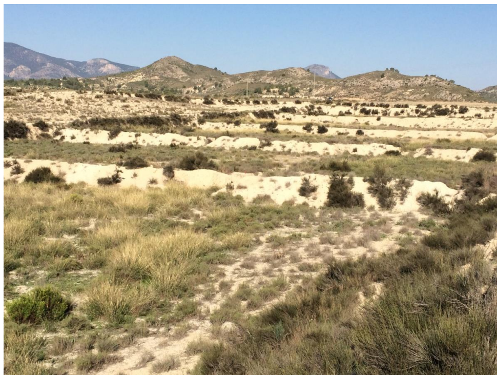
Figure 2. Abandoned terraces in the Upper Guadalentin basin in Murcia (southeast Spain). Land abandonment and slow revegetation produce soil erosion processes.