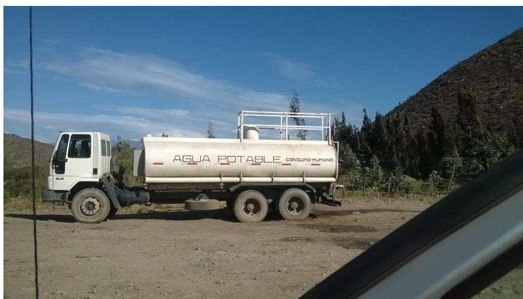
Figure 2. Truck delivering potable water in Petorca.

Moreover, the emergency policy measure of supplying RDW with water trucks is being constantly delayed. In 2014, the Petorca government counted 19,465 people being supplied by water trucks [61] (see Figure 2). In times of greater water scarcity, families in Petorca province are provided with 50 liters per person per day simply to perform their daily activities (the average consumption rate in Chile is 167 liters per person, according to the National Human Rights Institute (Instituto Nacional de Derechos Humanos, INDH) [58].