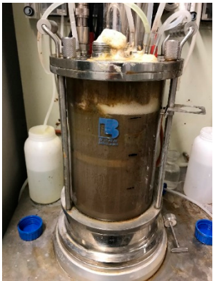
Figure S1. The conditions of the SBR at the end of the enrichment period.