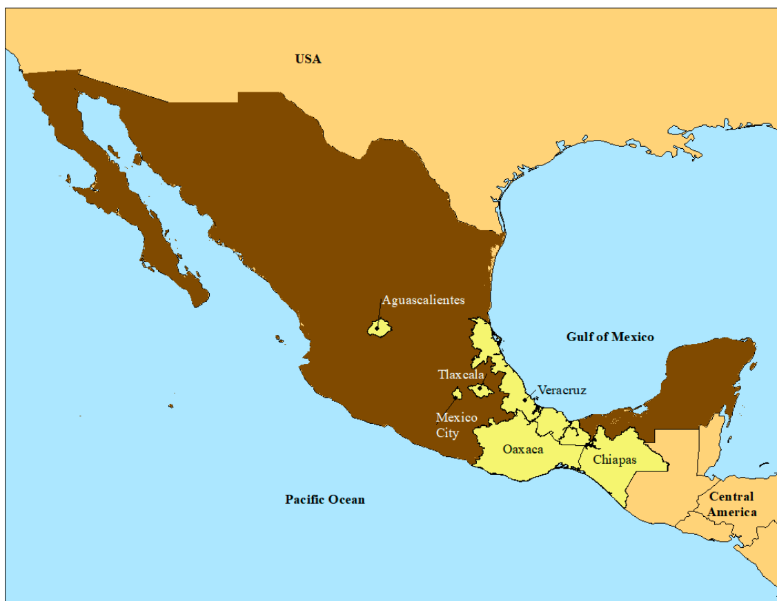
Figure 1. Contrasting water availability in Mexico, own elaboration with data from [10].