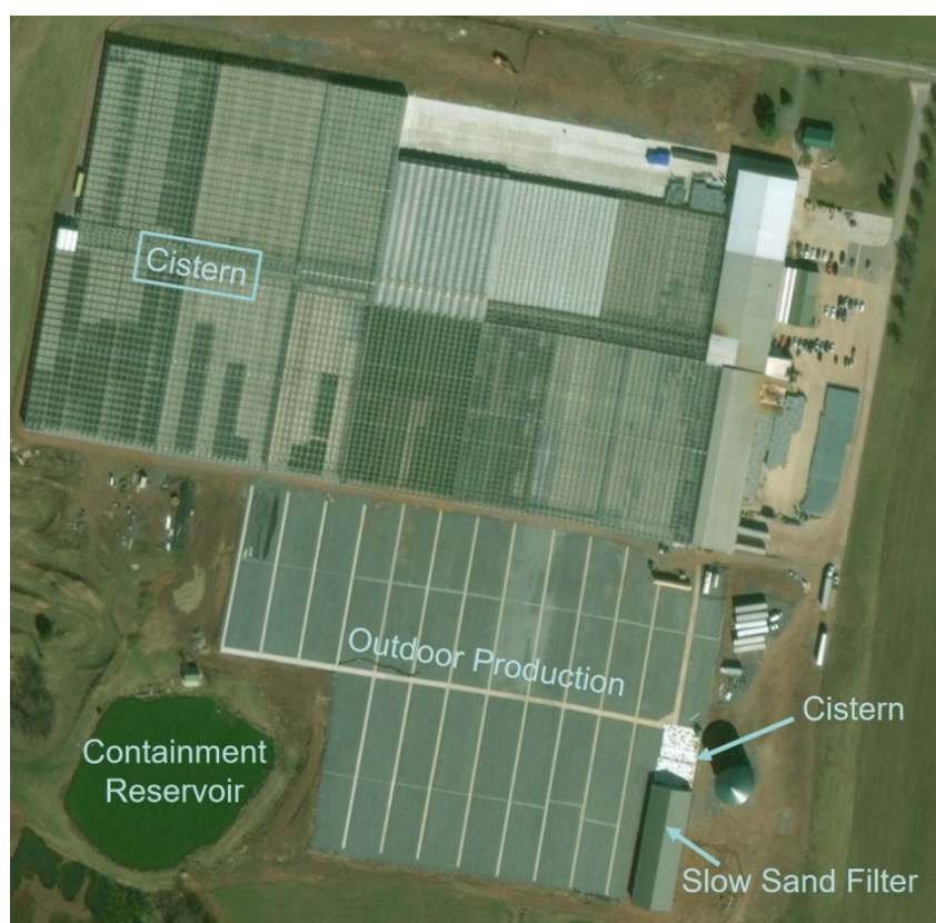
Figure 1. Aerial picture of case study A with 5.8 ha of indoor greenhouse growing area and 5.1 ha of outdoor growing area. Below-ground cisterns, water tank, and catchment reservoir allow this operation to now recycle up to 90% of its applied irrigation water.

Chlorine (liquid sodium hypochlorite) was used to sanitize reservoir water before the SSF system was installed. The reservoir water first passed through a coarse sand filter and then a glass bead filter prior to chlorine and sulfuric acid injection, in order to bring the pH down to 6.0 and make the chlorine more effective. However, now that the SSF is being used, chlorination has been eliminated to prevent disruption of the SSF “schmutzdecke” or biofilm. Once reservoir water has been filtered by the SSF, water is stored in a 2273 m 3 storage tank. This water is then pumped to the greenhouse or outdoor bed areas as needed for irrigation. Irrigation water runoff from the greenhouse floors is captured by the internal cistern for immediate reuse during periods where growth regulators are not used. During paclobutrazol application periods, the greenhouse runoff is diverted directly back to the catchment reservoir.