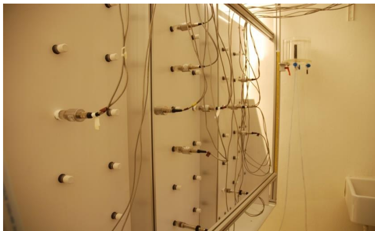
Figure 2. Pictures of the tank: a) front view (white marks correspond to pressure sensor locations), b) front view (blue cards indicate the water content sensor locations and white cards are used for normalization of the photographs), c) back view with sensor cables and one overflow outlet.