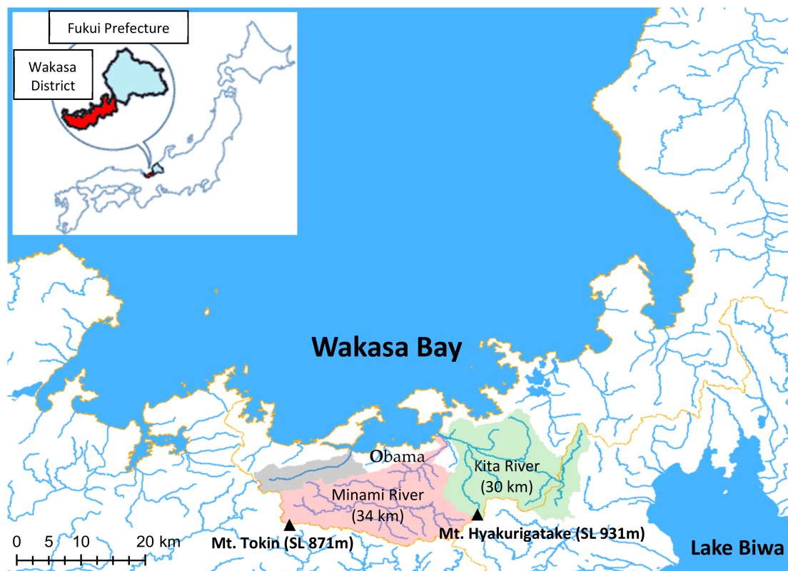
Figure 1. Map of the Wakasa District in Fukui Prefecture, including Obama City and the surrounding area.