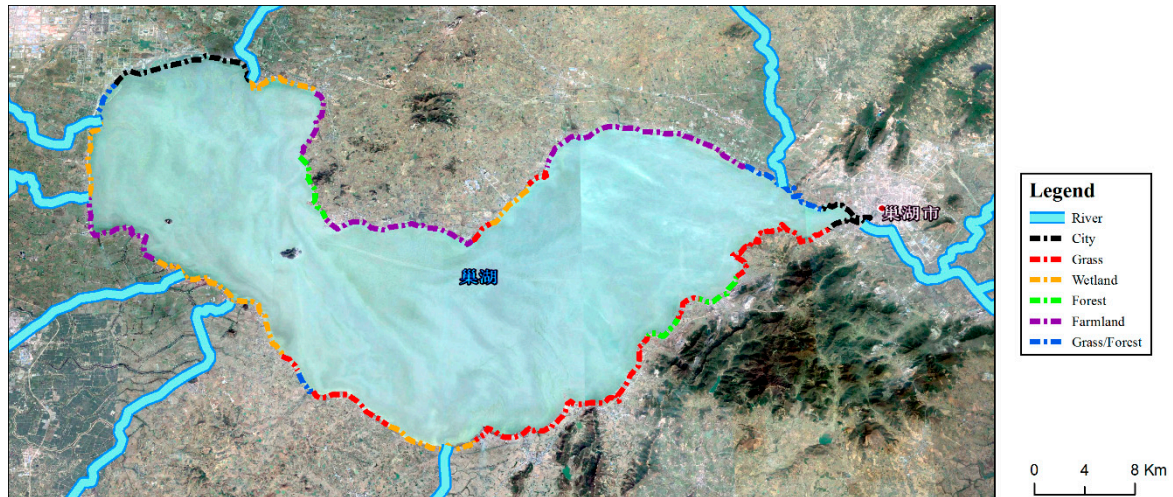
Figure S1. The distribution of different land use types in the littoral zone around Lake Chaohu.