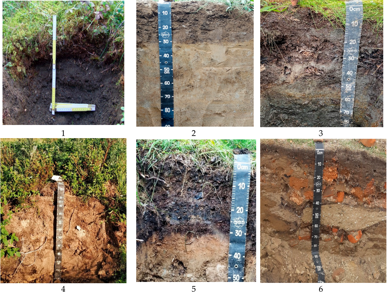
Figure 2. Cont.

Plantation plowing leads to a significant change in the morphology of the soil profile, which was a regular phenomenon in the Subarctic during the Soviet period. This horizon can be designated as turbic (TUR), and soils are identified as cryoturbozem (Turbic Cryosol in WRB) in the Russian soil taxonomy [26]. It can be highlighted that the thickness of humusenriched horizons of urban soils in Yamal and in the European part of the Arctic [27] is higher than in Yakutsk [28]. Thus, soil formation in Arctic cities is expressed not only in cryoturbation or stagnation, which is typical of natural tundras, but also in the formation of humus-enriched horizons, which leads to the formation of darker-color humus horizons being generally characterized by a lighter particle size distribution.