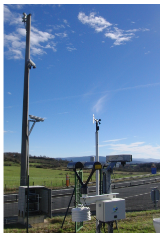
Figure 2. The recording station at the Col de la Fageole (A75 highway, France). The site is instrumented with a camera and weather sensors.

Upon completing the image acquisition phase, the data were automatically labelled by associating each image with the corresponding weather data. In this study, the snow case is not addressed. The used database contains over 195,000 images covering five weather conditions, distributed as indicated in Table 3: day normal condition (DNC), day light fog (DF1), day heavy fog (DF2), day light rain (DR1) and day heavy rain (DR2). To avoid introducing bias into the results while training and testing the algorithm, images acquired during even days were used first to train the algorithm, then images acquired during odd days were used for the test. Dividing up the database in this way ensures that similar images are not used for the training and testing phases, which may otherwise have introduced severe bias into the results.