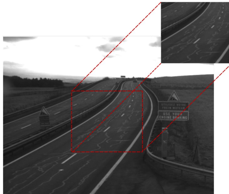
Figure 3. Example of fixed scene extracted from an image center, which belongs to the Cerema-AWH database.