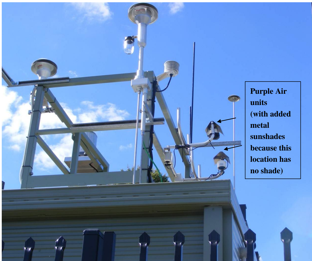
Figure S1. Two Purple Air Monitors installed on the roof of the NSW Government Station.

Received: 14 July 2020; Accepted: 8 August; Published: date