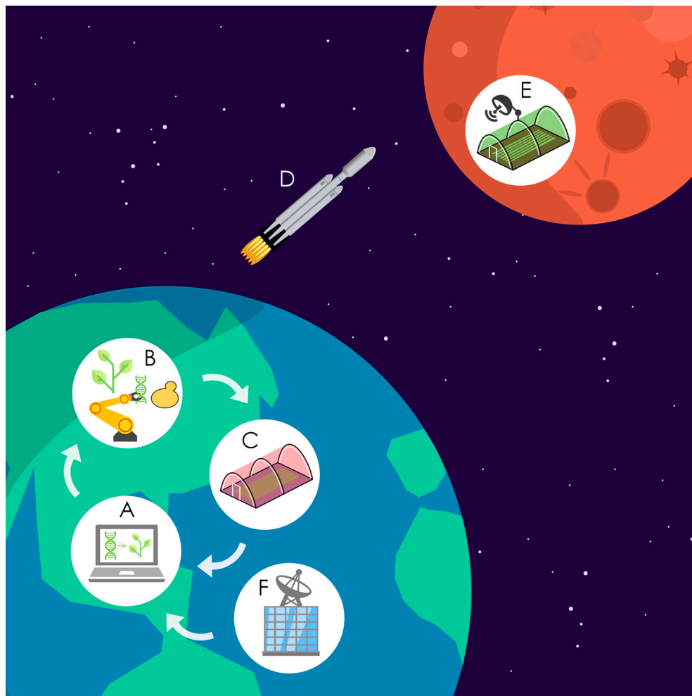
Figure 3. Schematic roadmap for research on adapting life to Mars. The Mars Biofoundry integrates the design of synthetic biology approaches (A) with an automated platform for implementing bioengineering designs in plants and microbes (B) and a facility for high-throughput phenotyping under simulated Martian conditions (C). The process iterates as a design-build-test cycle. Eventually, engineered organisms could be periodically transported to Mars (D) to perform experiments within miniature growth facilities (E). Remote monitoring of performance on Mars (F) would provide critical knowledge to adjust the work carried out at the biofoundry on Earth.

Achieving the proposed goals of adapting plant and microbial life to thrive on a Martian environment in a timeframe compatible with the forthcoming human expeditions to the red planet will require novel approaches. We propose that this formidable challenge can be tackled by establishing a ‘Mars Biofoundry’, that is, an automated and versatile platform capable of expediting the engineering and high throughput phenotyping of biological systems adapted to the environmental conditions that will be encountered on Mars (Figure 3).