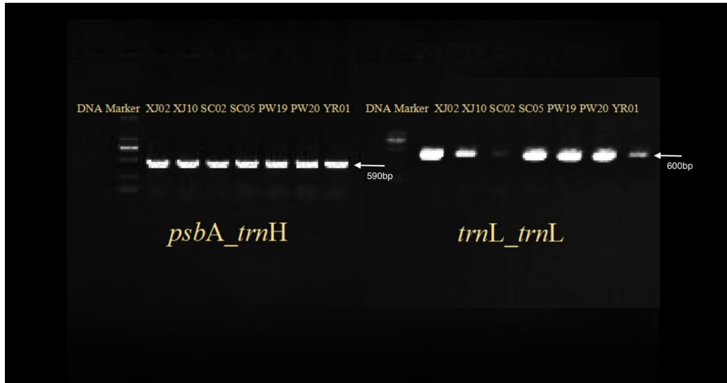
Figure S1. Electrophoresis of PCR amplification products of two primer pairs ( psbA-trnH and trnL-trnL ). Seven samples from four populations (XJ, SC, PW, and YR) were marked on the top line. Band sizes were indicated for amplifications of each primer pair.