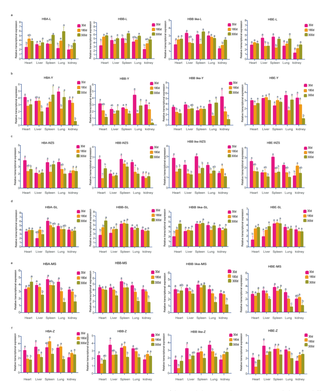
Figure 4. Expression patterns of hemoglobin-encoding genes in adult pig different tissues. ( a – f ) represent expression of HBA , HBB , the HBB-like and HBE gene in Landrace (L), Yorkshire (Y), Wuzhishan (WZS), Songliao black (SL), Meishan (MS) and Tibetan (Z), respectively. Data are shown as mean \pm SEM (n = 3 to 6), student's t -test. Relative expression was calculated as: Lg2<sup>- \Delta\Delta Ct</sup>. p < 0.05 was considered to be statistically significant. significant a, b, c indicate significant difference.

expression of HBB-like gene decreased at first but then increased with the increase in age. In liver, lung and kidney tissues from the Meishan pigs, the four genes were significantly down-regulated at 300 days of age. Moreover, the expressions of HBA and HBB genes decreased with the increase in age, but the expressions of HBB-like and HBE genes had no significant difference in spleen tissue form the Meishan pigs. In heart tissue of the Tibetan pigs, the expression of HBA gene decreased at 180 and 300 days, but the other three genes were only deceased at 180 days. In the Tibetan pig lung tissue, the expression levels of the four genes showed a significant decrease at 300 days of age.