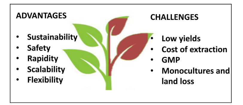
Figure 2. Advantages and disadvantages of plant molecular farming.

Many pharmaceuticals have been produced in plants, some of which have also been tested in clinical trials [106,107]. Examples include the animal-derived peptides with therapeutic properties such as human insulin, human serum albumin and even HIV-neutralizing antibodies that have been produced from tobacco and corn seeds in the clinical trials financed by the projects Pharma-Planta and Future-Pharma [108]. Another example is a chimeric secretory IgA/G developed in transgenic tobacco plants that was marketed as a medical device (CaroRx) to prevent dental caries [107].