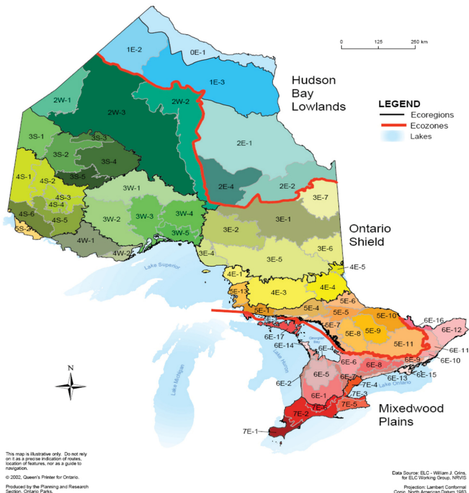
Figure A1. The ecozones, ecoregions and ecodistricts of Ontario [3].